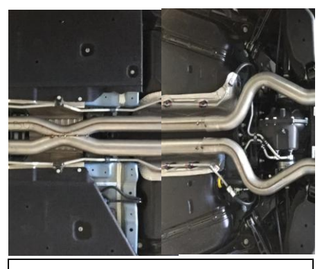
3. Install Item C onto the headpipes using clamps Item I to secure. Do not tighten. Install Item D & E onto the X pipe. Keep everything loose.

2. Install the PS headpipe Item A and Item B onto the factory pipes. Reuse the factory gaskets and hardware. Do not tighten. Keep loose until final fitment. Install O2 sensor at the end of the install.