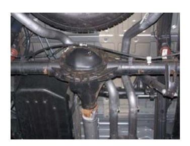
7. Install passenger side tailpipe #C into muffler at least 1.5" to 2". Use clamp #G to secure pipe to muffler. Do not tighten. The tailpipes will both lean towards the driver side for clearance. Insert welded hangers into rubber grommets.