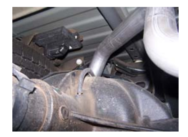
6. Install driver side tailpipe #D into muffler at least 1.5" to 2". This pipe will route over the axle and between the shock and spare tire. Use clamp #G to secure pipe to muffler. Do not tighten. Insert welded hangers into rubber grommet.