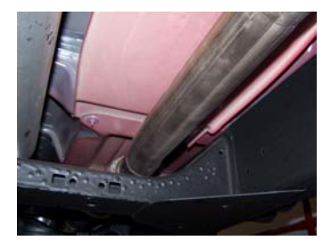
3. Bolt headpipe #A to the stock flange re-using the factory nuts and bolts. Insert welded hanger into rubber grommet. Do not tighten.