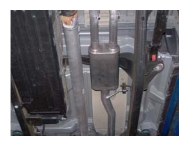
4. Install muffler #B with inlet towards Y-pipe. Use jack stands to support the muffler. Use clamp #F to secure the muffler to headpipe. Do not tighten.