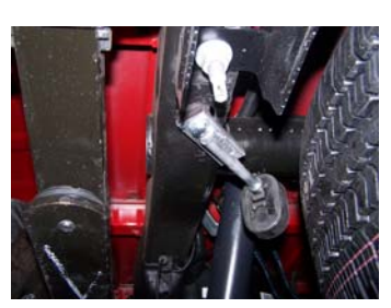
5. Install metal hanger #H into hole located approximately 16" from the rear of the frame. Use hardware kit #I, washer #M, and rubber grommet #J.