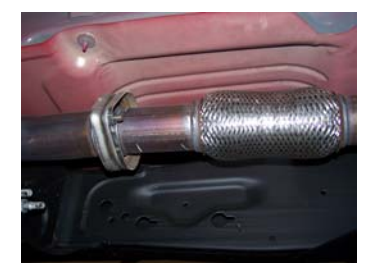
2. To remove stock exhaust, unbolt it at the flange behind the Y-pipe. Make sure to leave all rubber grommets in the factory location. You will reuse stock nuts and bolts. For easier removal of exhaust, cut behind the muffler. Use WD-40 to remove hangers from grommets.

1. Disconnect the negative battery cable before removal of OEM exhaust. This will allow the computer to reset and recognize the new exhaust. Lay out the exhaust on the floor so it looks like the drawing and compare parts with manual.