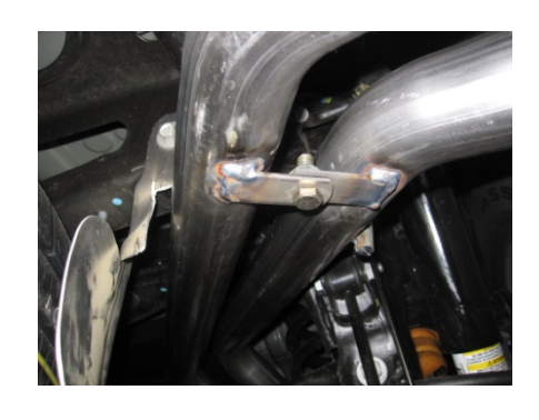
6.Once tailpipes are installed use bolt kit #H to secure pipes together the driver side tab will be on the bottom.