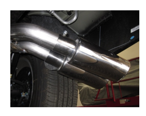
7.Install your tips to your desired look.

"MAKE SURE YOU HAVE A 1" CLEARANCE ON ALL PIPES FROM ALL RUBBER BRAKE LINES, SHOCK BOOTS, TIRES, ETC..." TORQUE ALL CLAMPS TO APPROX. 100 TO 150 FT LBS.