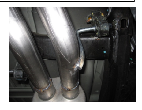
4.Next install passenger side overaxle tailpipe #C into muffler 1.5" to 2" insert welded hanger into rubber grommet use clamp # F to secure pipe to muffler do not tighten