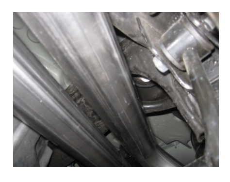
5.Next install the drivers side tailpipe into the muffler 1.5"-2"