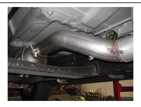
2.Install headpipe #A onto your factory pipe using your stock clamp insert welded hanger into the rubber grommet leave clamp loose.

1. Disconnect the negative battery cable before removal of the OEM Exhaust. This will allow the computer to reset and recognize the new exhaust. Lay out the exhaust on the floor so it looks like the drawing and compare parts with manual. Remove the factory exhaust by cutting behind the factory muffler. Once the tail pipe has been removed un-bolt the muffler and head pipe at the clamp located in front of the factory muffler. Use wd-40 or another type of penetrating oil to remove the rubber grommets. Do not damage these they will be re used.