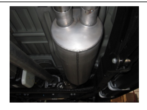
3. Install muffler #B onto headpipe 1.5" to 2" muffler should be level use clamp #E to secure together do not tighten.