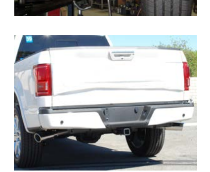
INSTALL YOUR STAINLESS TIPS TO YOUR DESIRED LOOK THEN GO BACK AND TIGHTEN ALL CLAMPS, ROTATE SYSTEM FOR BEST CLEARANCE BEFORE TIGHTENING.