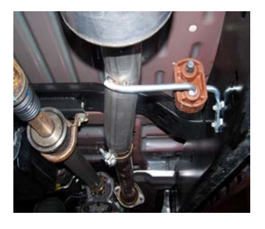
INSTALL HEADPIPE #A INTO STOCK FLANGE., ATTACH WITH BOLT KIT PROVIDED. DO NOT TIGHTEN. INSERT WELDED HANGER INTO RUBBER GROMMET.

INSTALL DRIVERS SIDE TAILPIPE # D INTO MUFFLER 1\frac{1}{2} " TO 2". INSERT WELDED HANGERS INTO RUBBER GROMMETS. USE CLAMP # H TO SECURE PIPE TO MUFFLER, DO NOT TIGHTEN.