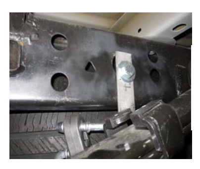
ON DRIVER SIDE: ATTACH REAR TAILPIPE HANFGER #I TO FRAME USING BOLT KIT PROVIDED

MAKE SURE YOU AT LEAST A 1" CLEARANCE ON ALL BRAKE LINES, FUEL LINES, SHOCKS, TIRES, ETC. USE ZIP TIES TO TIE BRAKE LINES OUT OF THE WAY.