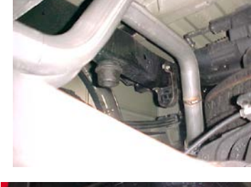
PHOTO INSTALL MUFFLER # B ONTO HEADPIPE 1 ½" TO 2". USE CLAMP # G TO SECURE MUFFLER TO HEADPIPE. DO NOT TIGHTEN. USE A JACK STAND TO HOLD UP THE MUFFLER. OUTLETS SHOULD BE

INSTALL HEADPIPE # A INTO STOCK PIPE. THE END OF THE PIPE SHOULD BE AT THE 12 O'CLOCK POSITION, ATTACH WITH FACTORY CLAMP. DO NOT TIGHTEN. INSERT WELDED HANGER INTO RUBBER GROMMET. REMOVE THE HANGER FRO THE FRAME & RELOCATE TO THE HOLES JUST TO THE LEFT OF THE OTHER HOLES YOU WILL NEED TO PRY THE INSERTS OUT & RE-INSTALL SEE PHOTO