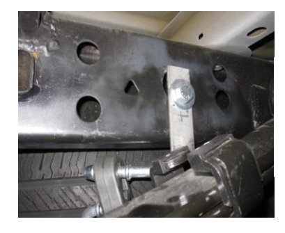
ON DRIVER SIDE: ATTACH REAR TAILPIPE HANFGER #I TO FRAME USING BOLT KIT PROVIDED

(**Exit Pipes left long for adjustability.)