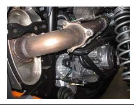
2. Once you have removed the heat shield remove the factory brackets and re install the Gibson supplied brackets #E using the factory bolts and factory location. Keep loose until final install.

1. Disconnect the negative battery cable before removal of the OEM Exhaust. This will allow the computer to reset and recognize the new exhaust. Lay out the exhaust on the floor so it looks like the drawing and compare parts with manual. Remove the factory exhaust by unbolting the factory rear heat shield bumper behind the factory muffler. You will re use the hardware for the Gibson install. Disconnect the 2 factory springs and unbolt the factory exhaust. Do not damage the factory exhaust gasket. You will re use this gasket.