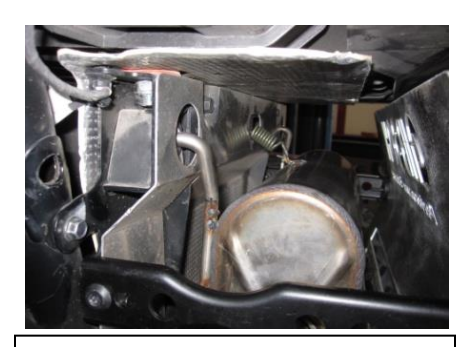
3. Next install the Gibson Muffler assembly. Install the top hanger mounts first then slide the inlet over the factory head pipe reusing the factory nuts to secure flange. Tighten the nuts to factory torque spec.