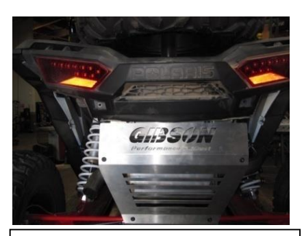
5. Use the factory bolts to install. Once they have been installed tighten the Gibson brackets at the RZR frame. Adjust plate for a level finish. Recheck all hardware for tightness and then go have fun.

"MAKE SURE YOU HAVE A 1" CLEARANCE ON ALL PIPES FROM ALL RUBBER BRAKE LINES, SHOCK BOOTS, TIRES, ETC..."