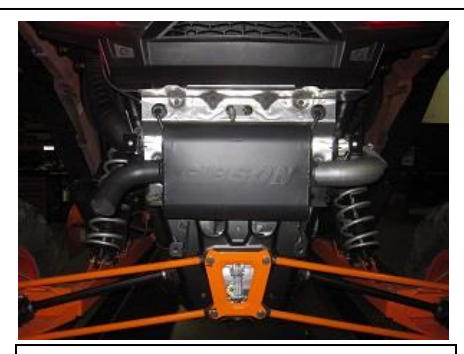
4. Reinstall factory springs on muffler and ensure muffler is positioned correctly in the factory location.