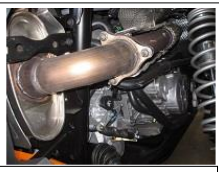
2. Once you have removed the heat shield loosen the factory exhaust. Unbolt the headpipe entirely and remove the factory exhaust.

1. Disconnect the negative battery cable before removal of the OEM Exhaust. This will allow the computer to reset and recognize the new exhaust. Lay out the exhaust on the floor so it looks like the drawing and compare parts with manual. Remove the factory exhaust by unbolting the factory rear heat shield bumper behind the factory muffler. You will re use the hardware for the Gibson install. Disconnect the 2 factory springs and remove the factory exhaust. Do not damage the factory exhaust gasket. You will reuse gasket. Replace with new if damaged.