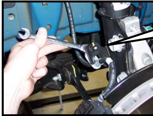
BRAKE LINE BRACKET