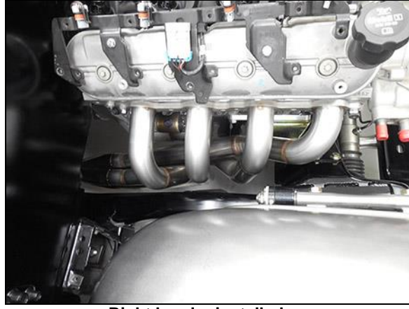
Left header installed