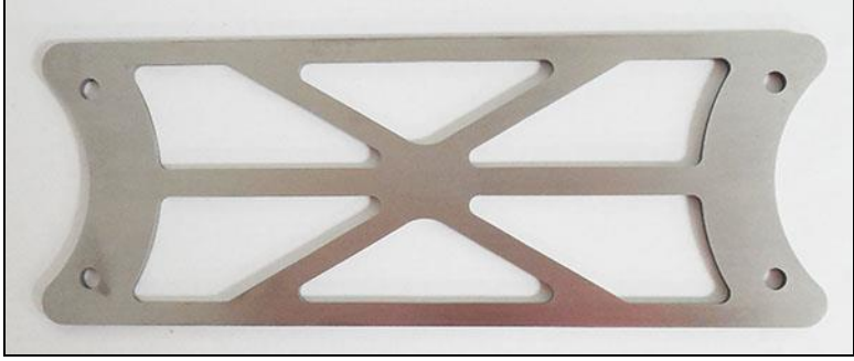
Figure 3 – Muffler Logo Plate without HOOKER Logo – P/N 10914HKR