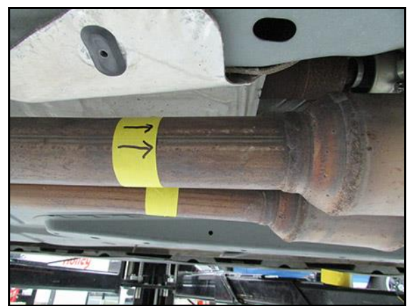
Figure 4 (Passenger's Side)