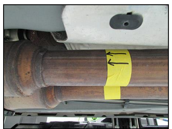
Figure 3 (Driver's Side)

4. Use masking tape to wrap around the OE mid pipe where your final permanent marks are to ensure a straight cut. Draw arrows to ensure you cut at the correct side of the masking tape.