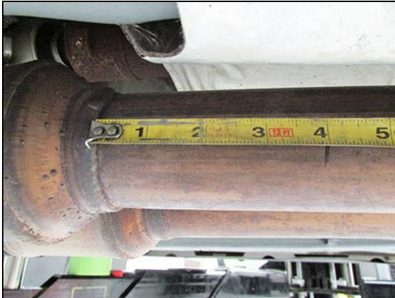
Figure 1 (Driver's Side)