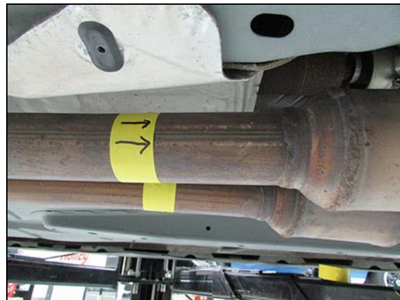
Figure 4 (Passenger's Side)