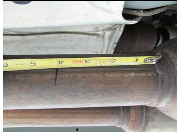
Figure 2 (Passenger's Side)