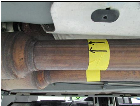
Figure 3 (Driver's Side)