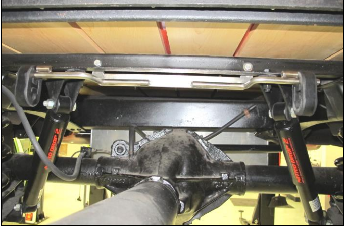
Front Tailpipe Hanger Frame Bracket Installation Figure 1