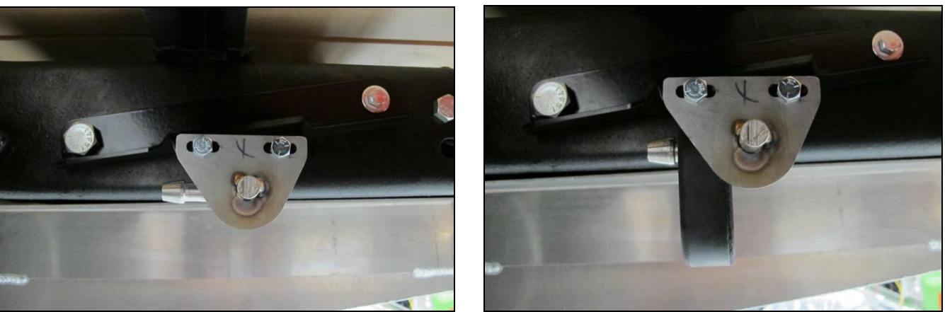
Driver's Side Dual Side Exit System Tailpipe Hanger Installation Figure 4

5. For dual rear exit system installations, attach the supplied rear tailpipe hanger brackets onto the rear tailpipe hanger frame brackets using the supplied 1/4" bolts and nuts. Orient the hanger brackets so that their barbed hanger rods are pointing towards the front of the vehicle and are oriented inboard towards the frame rails. Once the brackets are attached, install one supplied rubber isolator onto the hanger rods of each of them. See the images in Figure 4 for visual reference to this step.