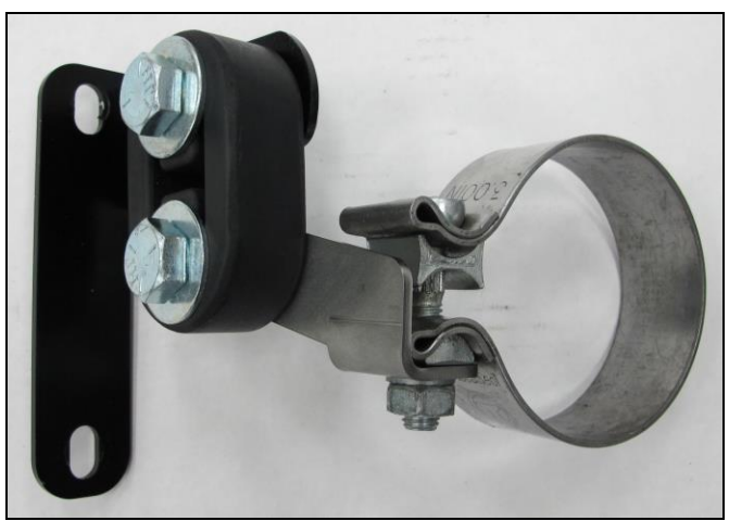
Passenger's Side Crossmember Hanger/Clamp Assembly

Now assemble the left and right crossmember hanger/clamp assemblies to visually match the depiction of the assemblies in Figure 5 below. Each assembly will be comprised of two supplied 1/2" bolts/washers/nuts, two supplied brackets, and one supplied band clamp. Remove and reinstall the nuts/washers from the two supplied band clamps to perform this task.