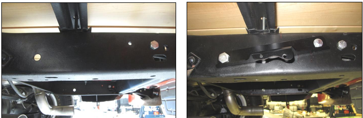
Driver's Side Tailpipe Hanger Frame Bracket Installation Figure 2

3. Attach the supplied rear tailpipe hanger brackets onto the outside of the rear frame rails behind the rear tires. Use one supplied 5/8" and 5/16" nut and bolt, and the existing 5/8" and 5/16 holes in each frame rail for this purpose. The small bent flanges of each bracket that the two 1/4" holes lie on will point towards the ground when the brackets are in their correct left/right side orientation. Refer to the images in Figure 2 below for visual reference.