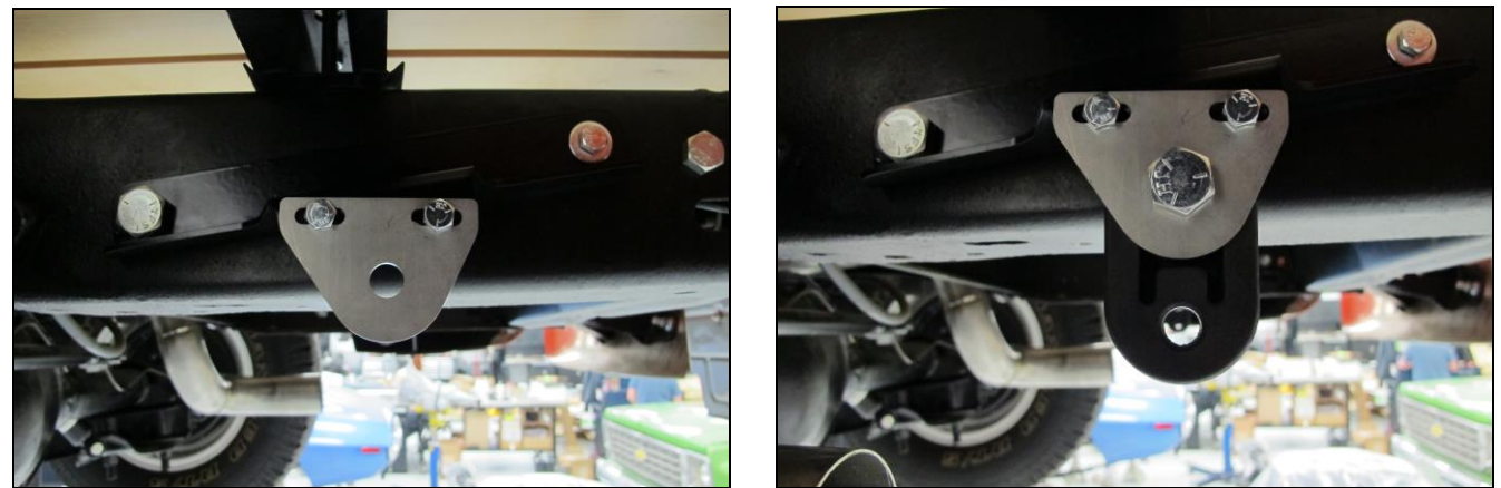
Driver's Side Dual Rear Exit System Tailpipe Hanger Installation Figure 3

4. If you are installing a dual side exit system, skip ahead to step 5. If you are installing a dual rear exit system, attach the supplied rear tailpipe hanger plates onto the rear tailpipe hanger frame brackets using the supplied 1/4" bolts and nuts. Orient the hanger plates so that the small half-circle notch in the outer profile is positioned towards the rear of the vehicle. Once the plates are attached to the brackets, attach one supplied rubber isolator to them using one supplied 1/2" bolt, nut, and washer for each. Place the washers between the nuts and the isolators on the inboard side of the hanger assemblies. See the images in Figure 3 below for visual reference to this step.