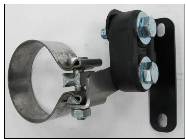
Driver's Side Crossmember Hanger/Clamp Assembly