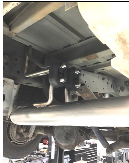
Figure 2 Rear tailpipe hanger to frame

NOTE: The intended attachment holes are sometimes occupied by rivets holding a specific stock exhaust hanger to the frame. You must remove the rivets and the stock hanger to enable proper installation of the supplied hangers. A cut-off wheel or grinder can be used to efficiently remove the rivet head prior to driving the rivet out of the hole with a punch and chisel.