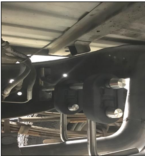
Figure 1 After muffler hanger rod attachment to frame