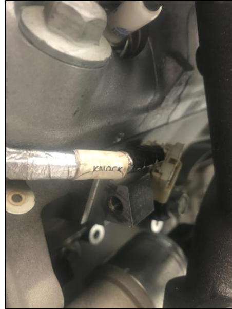
New Clocked Position