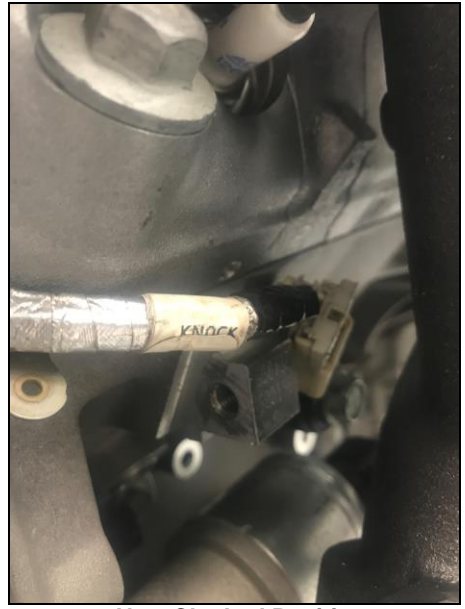
New Clocked Position