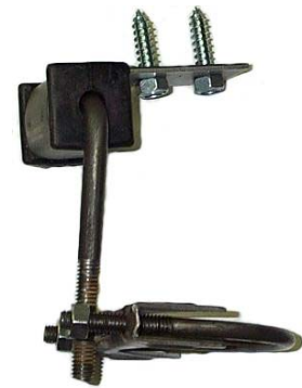
Front tail pipe hanger assembly