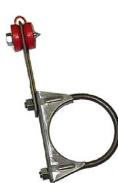
Rear tail pipe hanger assembly

Front tail pipe hanger consists of a BR92256 rubber mount for wire hanger, and a # 2743 2-1/2" hanger clamp with adjustable threaded rod hanger, and two lag screws.