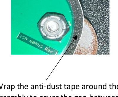
Wrap the anti-dust tape around the assembly to cover the gap between the circuit board and clear spacer