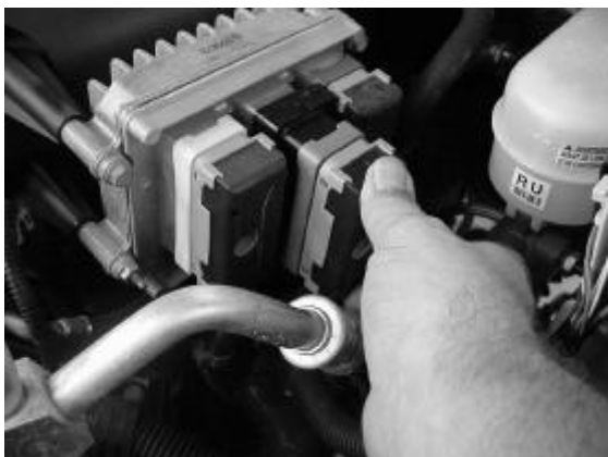
Fig # 5 reinstalling factory harness