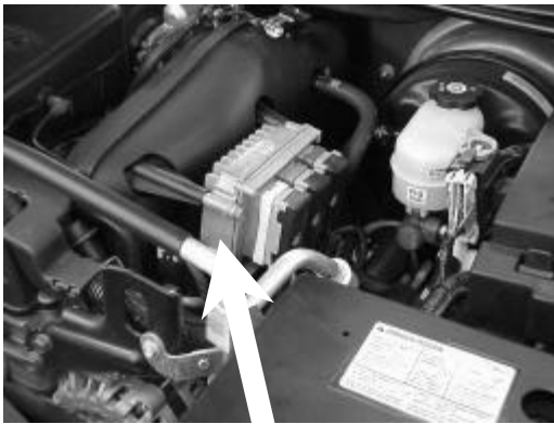
Fig # 1 ECM