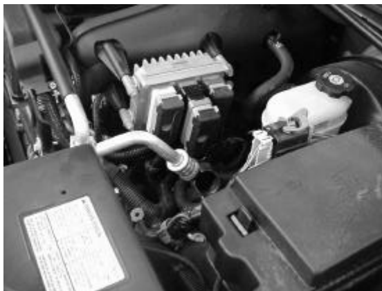
Fig # 6 installation complete

Have fun with your new power from JET Performance Products