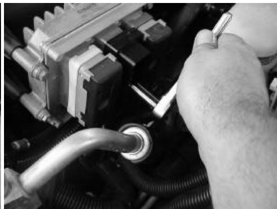
Fig # 4 tighten extender bolt