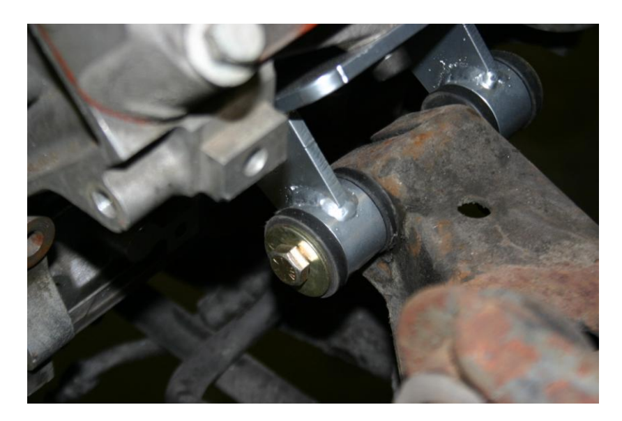
Step 3: Lift the rear of the transmission using a floor jack. Install the polyurethane transmission mount on the transmission, making sure that you install the provided 1/8" thick plate between the mount and the transmission (this preloads the polyurethane mount). Install the new transmission bracket the same way the factory bracket is installed to the crossmember. The 4L60e transmission will bolt to the front center slotted hole in the crossmember bracket. The T-56 transmission will bolt to the two rear slotted holes in the crossmember bracket. (note: the rubber T-56 transmount does not use the 1/8" thick preload plate)

Step 2: Lower the engine and transmission into the chassis and align the engine mounts with the frame mount perches in the car. Once lined up, slide in the 7/16" x 6 1/2" bolts to secure them to the frame. (be sure and use the large 7/16" flat washers on each side of the outer polyurethane engine mount bushings, otherwise, the bushings may work their way out of the mount under a load.) see photo below