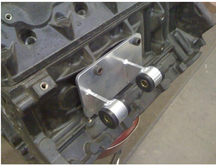
(Detailed view of driver's side motor mount on engine)