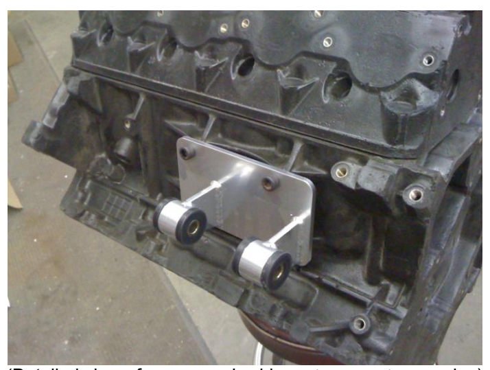
(Detailed view of passenger's side motor mount on engine)