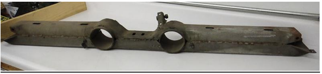
Turbo 400 X-member