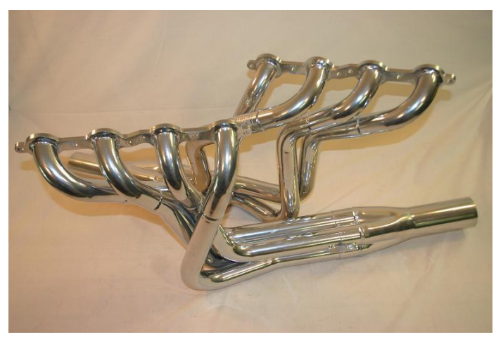
The Muscle Rod line of hedders from Husler is designed to bolt in with this kit for an easy bolt in install with great performance and fitment

Road test your vehicle to familiarize yourself with it's new handling characteristics. BRP cannot supervise your installation of these parts and systems cannot be held responsible more than the cost of the kit and/or parts. The vehicle should be operated normally. Contact BRP if you need anything or if we can be of assistance. (Check the BRP web site for additional help).