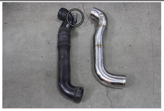
13. Remove the temperature sensor from the factory charge pipe to the HPS charge pipe.