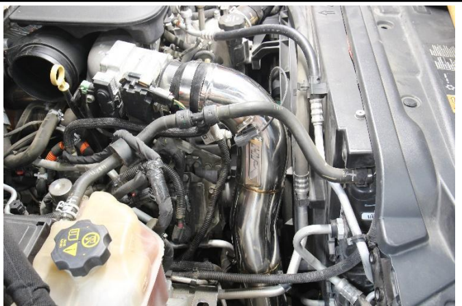
16. Insert the HPS charge pipe into the vehicle by inserting the charge pipe onto the intercooler side first.