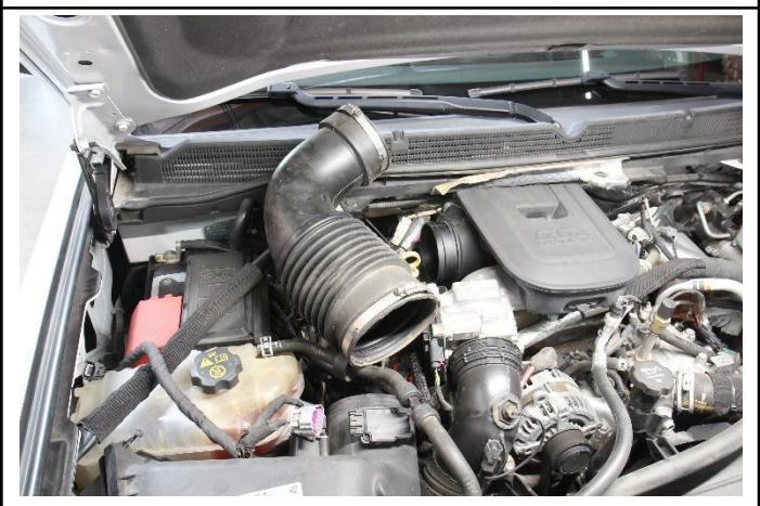
4. Remove the factory intake hose from the vehicle.