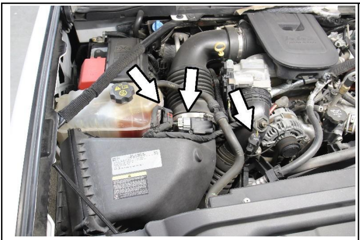
2. Disconnect the electrical harness connector from the sensors located on the air box and the cold side charge pipe.