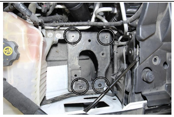
8. Remove the four bolts securing the air box bracket and remove the bracket from the vehicle.