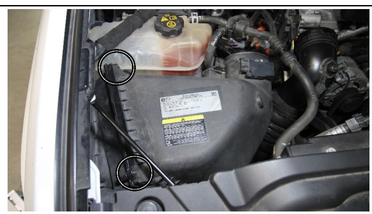
5. Loosen the two bolts securing the upper air box assembly.