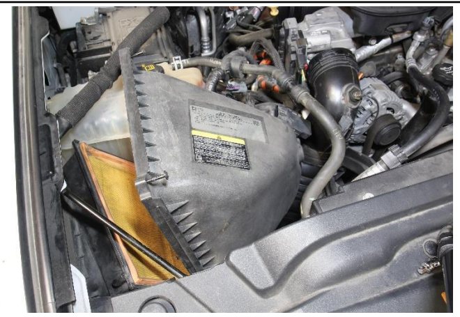
6. Remove the upper air box assembly from the vehicle.