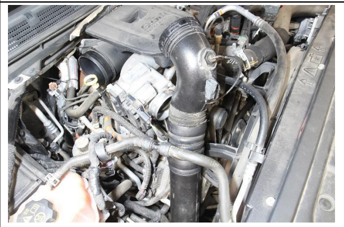
12. Remove the cold side charge pipe from the vehicle.