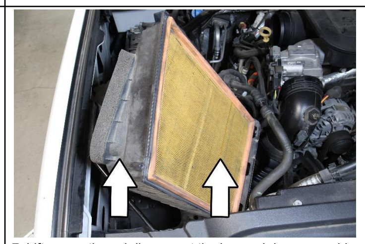
7. Lift up gently and disconnect the lower air box assembly from the rubber grommets. Remove the lower air box assembly from the vehicle.