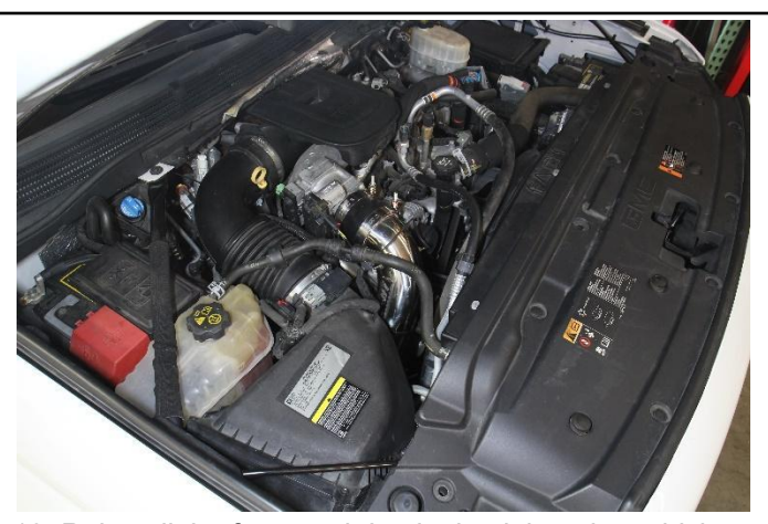
18. Reinstall the factory air intake back into the vehicle.