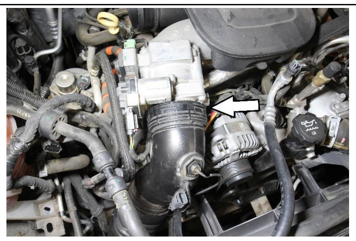
11. Using a flat head screwdriver, rotate the locking mechanism counterclockwise to release the charge pipe from the throttle body.