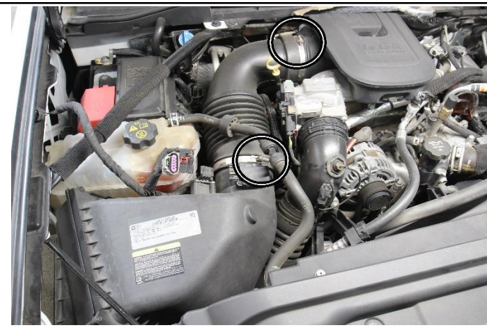
3. Loosen the hose clamp securing the factory hose from the air box and the turbo inlet.