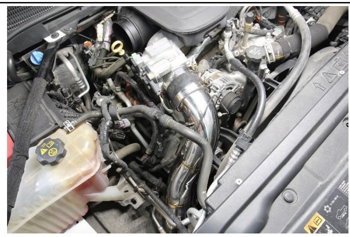
17. Insert the charge pipe into the throttle body coupler. Adjust the charge pipe into position and secure all the t-bolt clamps. Re-connect the air temperature sensor electrical harness.