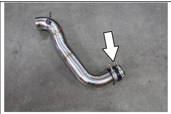
14. Insert the provided silicone reducer coupler along with the t-bolt clamps onto the end of the charge pipe indicated above.