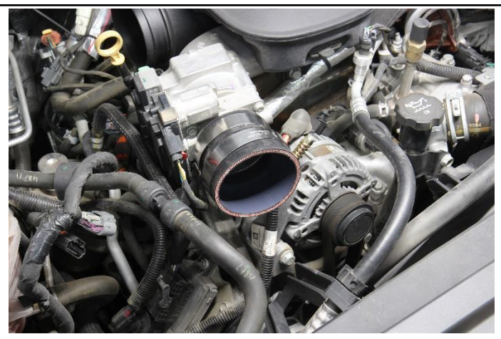
15. Install the remaining reducer coupler onto the throttle body along with the provided t-bolt clamps.