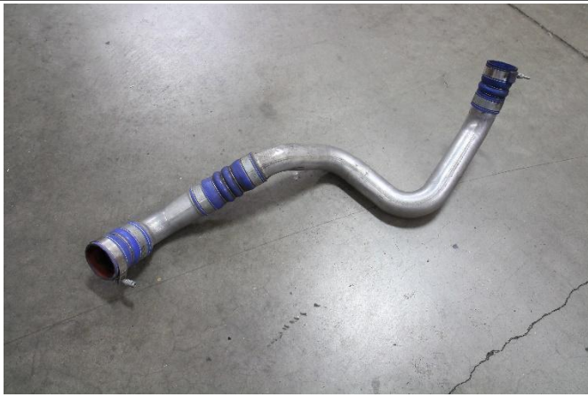
4. With an assistant, remove the hot side charge pipe by guiding the pipe towards the top.