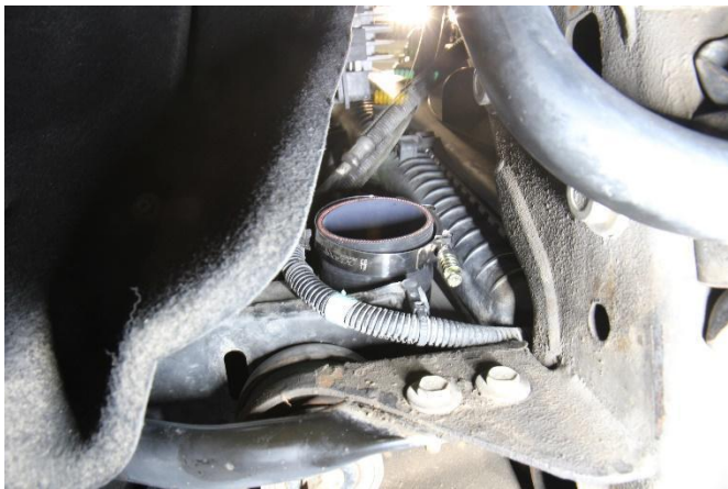
6. Install the other reducer coupler along with the provided T-bolt clamps onto the intercooler inlet.