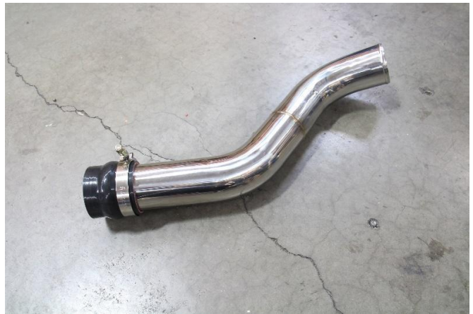
7. Install the hump coupler onto the long side of the hot side charge pipe.