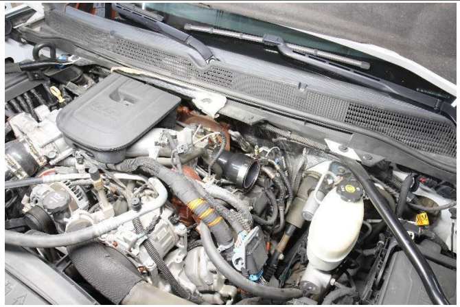
5. Install the long reducer coupler, along with the provided T-bolt clamps onto the turbo outlet.