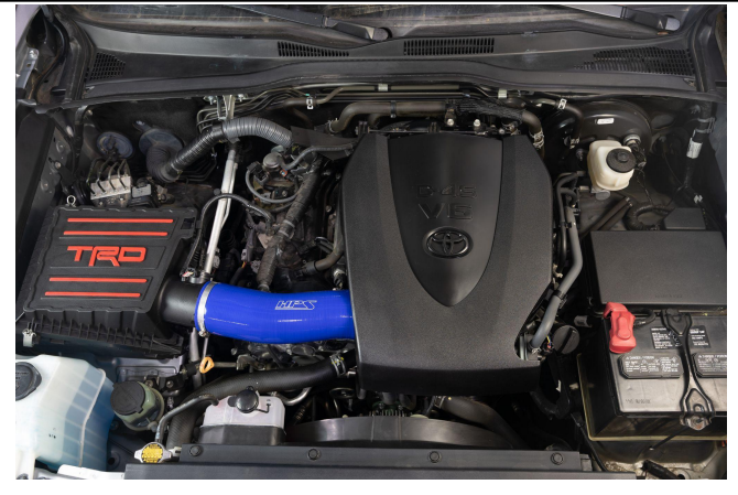
10. Reinstall the engine cover.