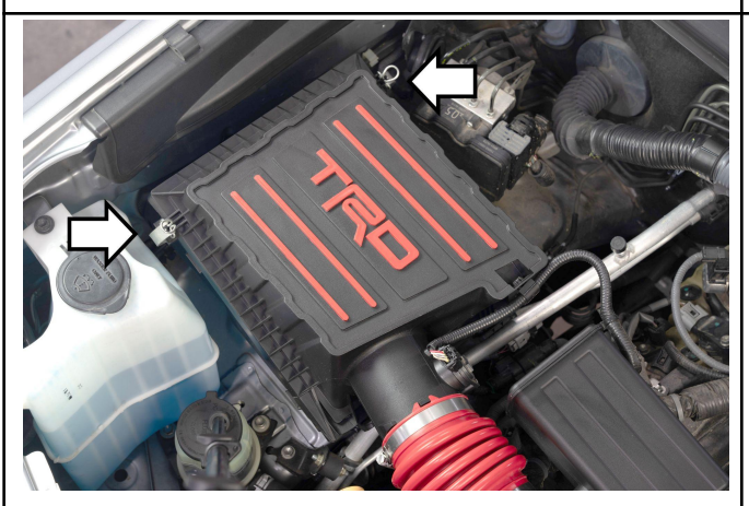
6. Unbuckle the 2 clips securing the upper air box then remove the original intake tube assembly from the vehicle.