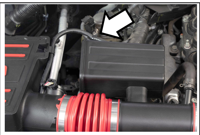
5. Unclip the electrical harness from the resonator.