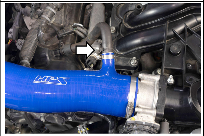
9. Reinstall the breather hose onto the HPS intake.