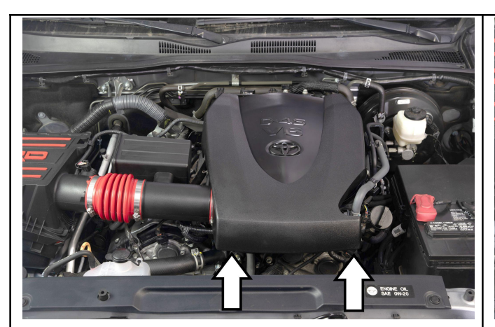
2. Lift and remove the engine cover from the vehicle.

NOTE: Disconnecting the negative battery cable erases pre-programmed electronic memories. Write down all memory settings before disconnecting the negative battery cable. Some radios will require an anti-theft code to be entered after the battery is reconnected. The anti-theft code is typically supplied with your owner's manual. In the event your vehicles' anti-theft code cannot be recovered, contact an authorized dealership to obtain your vehicles anti-theft code. We also highly recommend NOT discarding any stock parts after the installation.