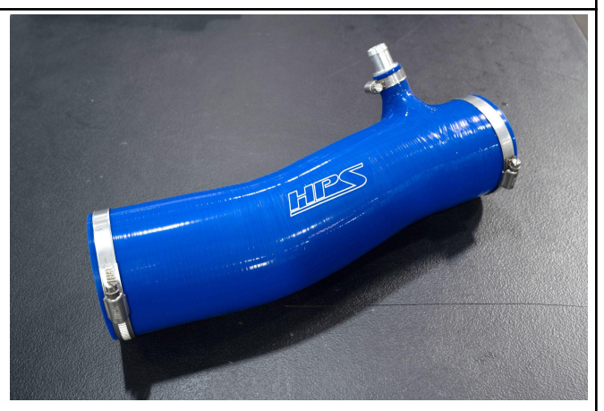
7. Install the provided hose clamps onto the HPS silicone intake tube. Tighten the clamp on the breather nipple to secure the barbed fitting.