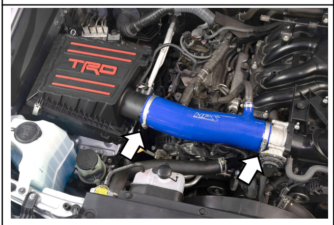
8. Insert the HPS intake onto the air box side first then onto the throttle body side and clip the air box back into place. Adjust the intake tube to the desired position and secure the hose clamps.