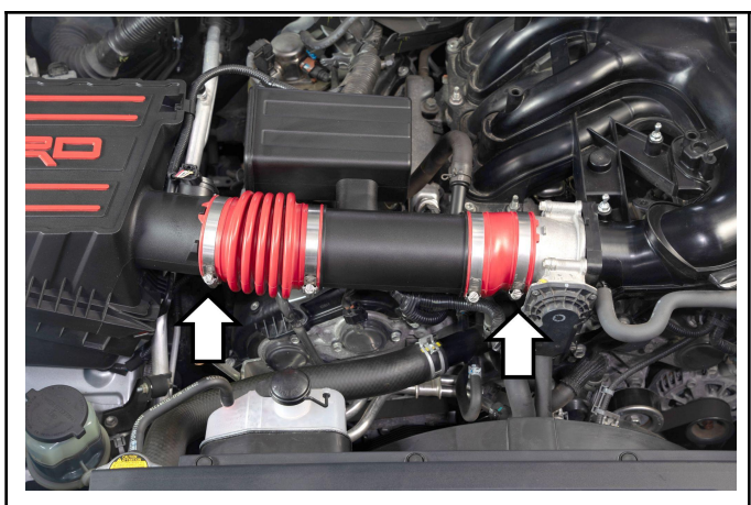
4. Loosen the hose clamps on the throttle body and the air box.