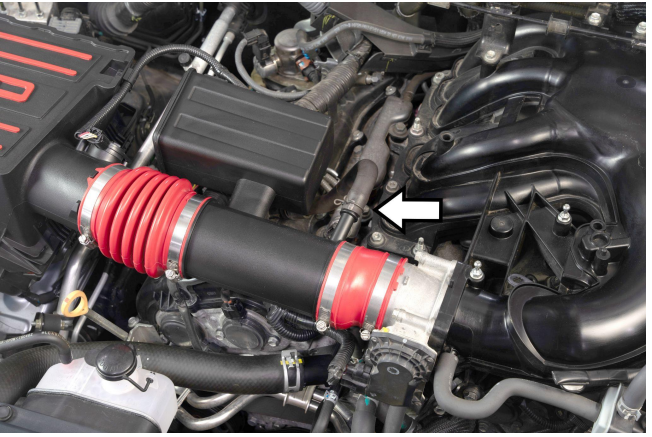
3. Disconnect the breather hose from the intake tube.