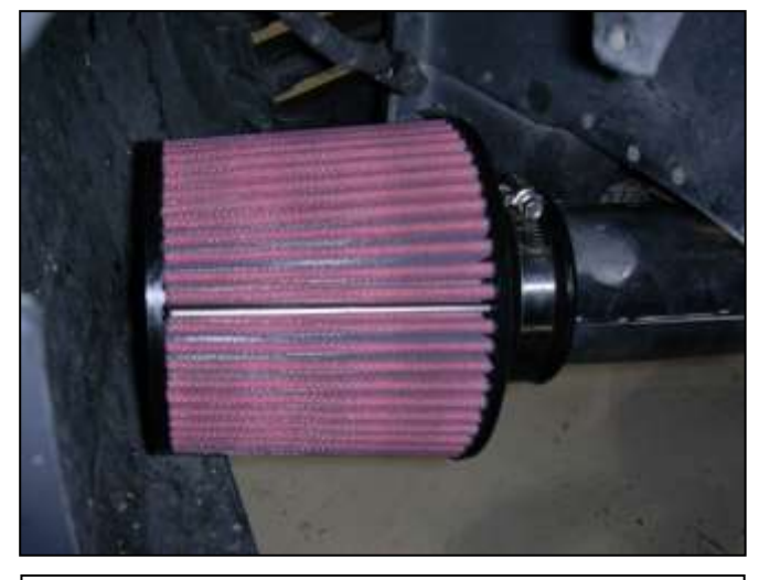
i. Install the AEM<sup>®</sup> air filter onto the end of the inlet pipe and secure in place with the supplied hose clamp.

h. Attach the supplied ½" breather hose to the intake pipe's nipple; connect the opposite end to the valve cover's inlet. Secure each end of the breather hose in place with the two supplied hose clamps.