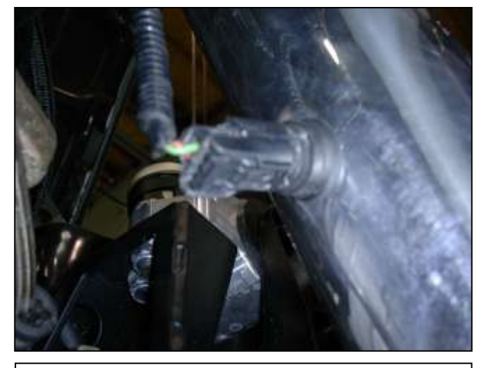
j. Install the inlet air temperature sensor into the grommet installed earlier in step #3e.