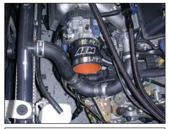
c. Install the supplied hose adapter onto the throttle body using the supplied #40 and #44 hose clamps. Use the #40 hose clamp on the throttle body.