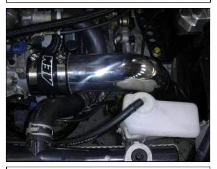
f. Insert the inlet pipe into the hose adapter and align the mounting bracket with the rubber mount installed in step #3d.

e. Install the supplied grommet into the intake pipe as shown.