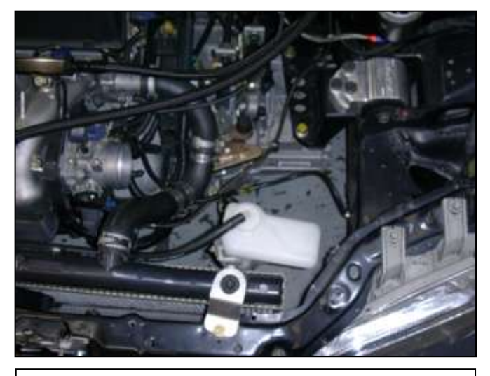
b. Factory airbox system removed from the vehicle.

a. When installing the intake system, do not completely tighten the hose clamps or mounting hardware until instructed to do so.