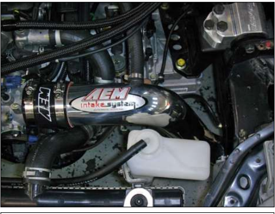
AEM<sup>®</sup> intake system installed