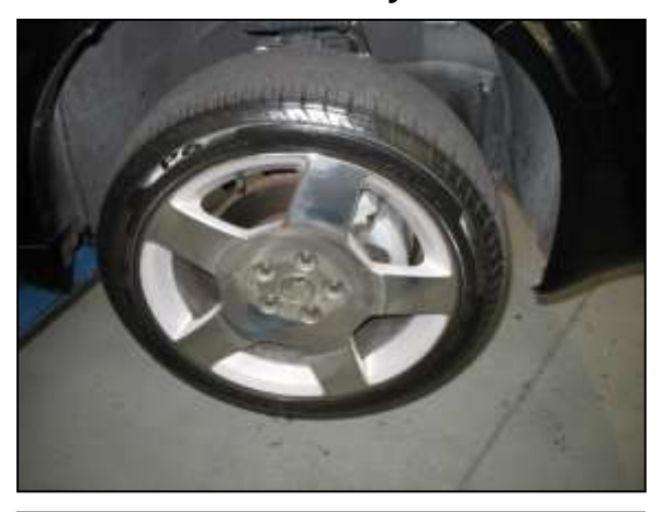
a. Remove passenger side wheel.