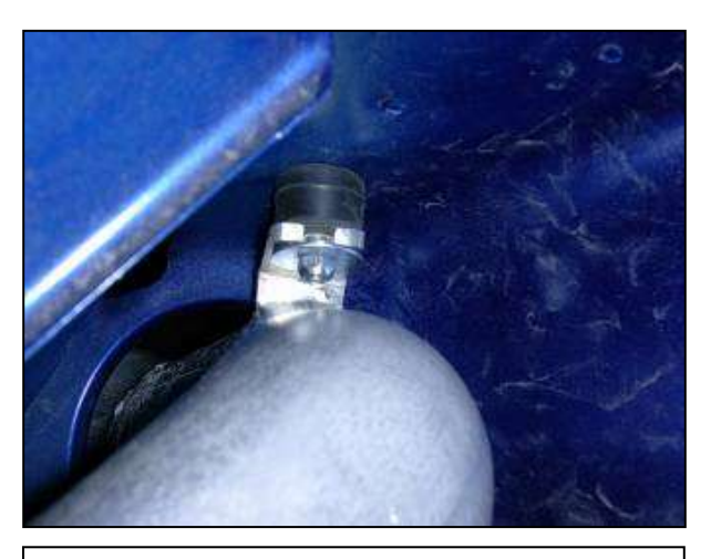
e. Use the supplied washer and serrated nut to secure the intake pipe. Install the air filter on the end of the pipe within the fender well. Secure the air filter to the intake pipe.