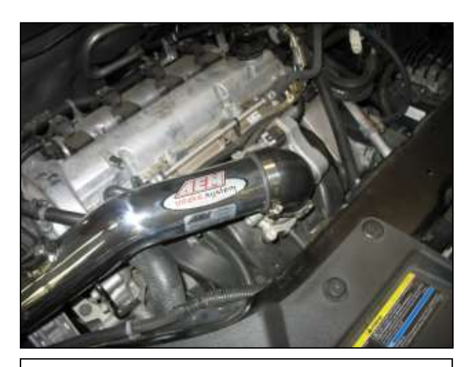
d. Assemble the intake pipe with the supplied 90 degree coupler and two #44 hose clamps. Line up the intake pipe bracket with the rubber mount. Then slide the coupler over onto the throttle body. Do not completely tighten the hose clamps or mounting hardware yet.