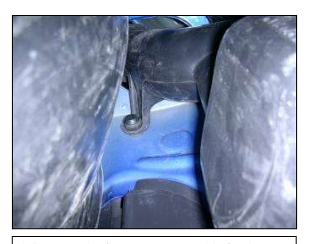
i. Remove the front passenger side fender liner to gain access to the lower air box. From inside the fender, release the plastic retainer near the top of the lower air box.