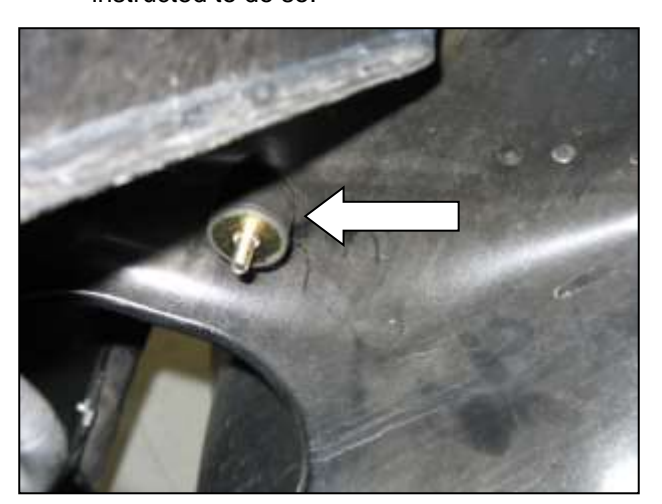
b. Install the supplied rubber mount into the hole where the factory lower air box was located.

a. When installing the intake system, do not completely tighten the hose clamps or mounting hardware until instructed to do so.