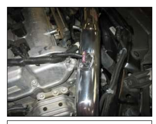
g. Use supplied bolts to secure the MAF sensor to the intake pipe. Then connect the wiring harness to the sensor.