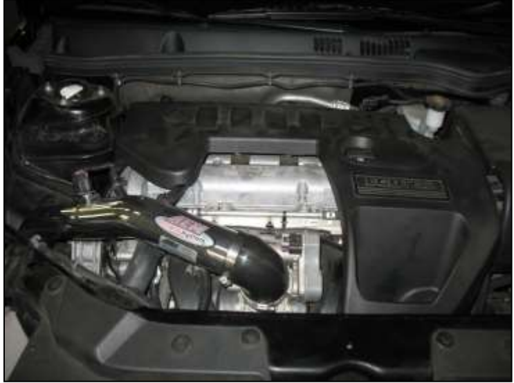
AEM® intake system installed