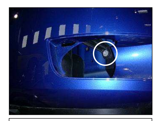
j. Remove the bolt at the front of the lower air box. Remove the lower air box from the vehicle. On the 2006 Cobalt you will need to gain access to this bolt by removing the front part of the fender liner and going underneath the car. After removing this bolt remove the lower box from the vehicle.