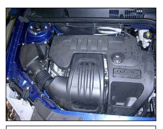
b. Factory air box system installed