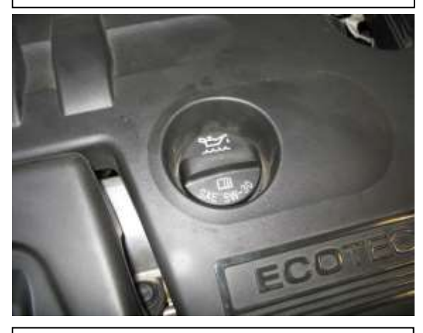
c. Remove the oil cap and then remove the engine cover. Re-install oil cap to avoid getting debris into your engine.