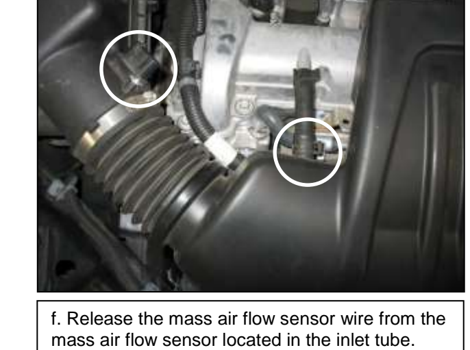
f. Release the mass air flow sensor wire from the mass air flow sensor located in the inlet tube. Also release the air breather hose clamp from the stock inlet tube.