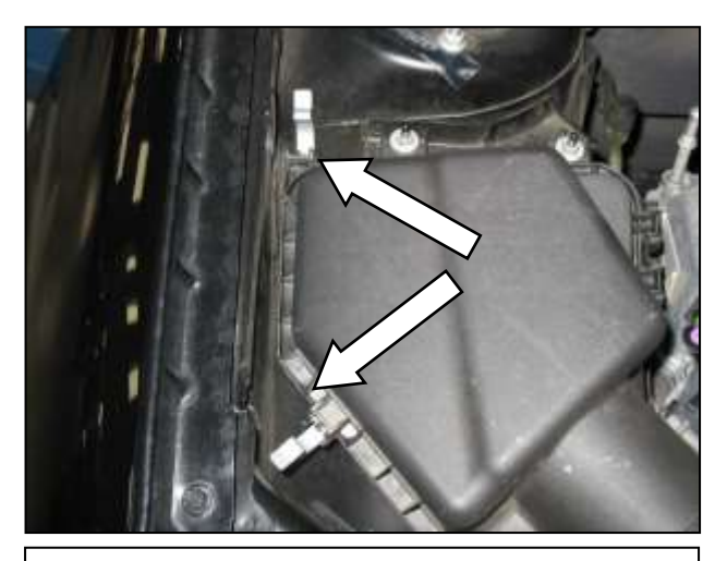
g. Release the two clips holding the air filter lid in place.