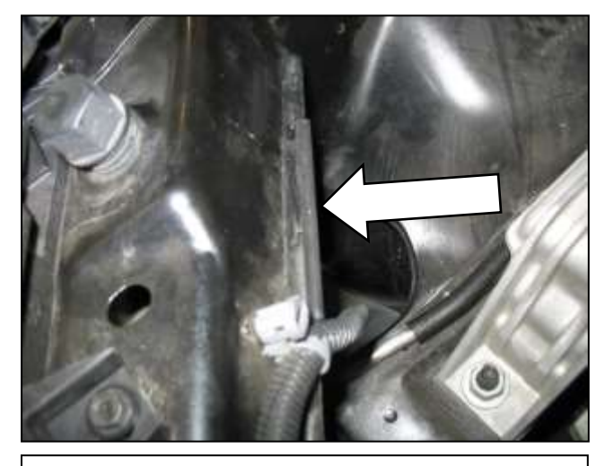
c. Install the rubber edge trim as shown.