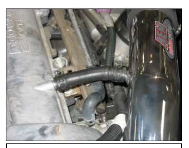
h. Secure the stock breather hose to the intake pipe nipple using the stock hose clamp.