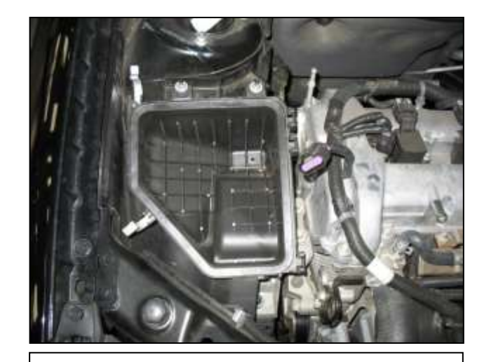
h. Pull straight up on the factory air lid assembly and remove it from the vehicle. Also, remove the stock air filter. Then remove the two nuts securing the lower air filter assembly in place and remove it from the vehicle.