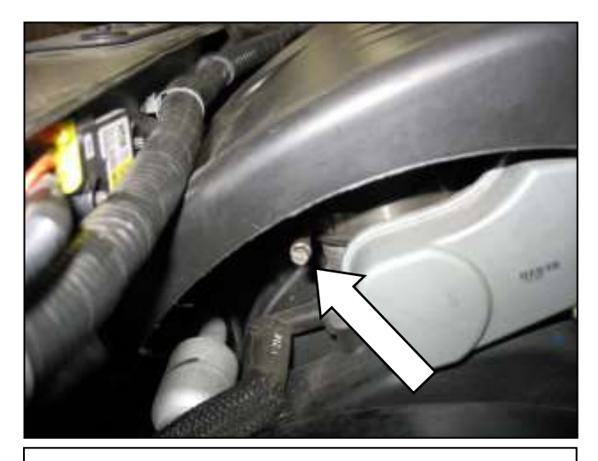
e. Loosen the hose clamp securing the stock inlet tube to the throttle body.