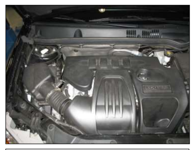
Factory air box system installed