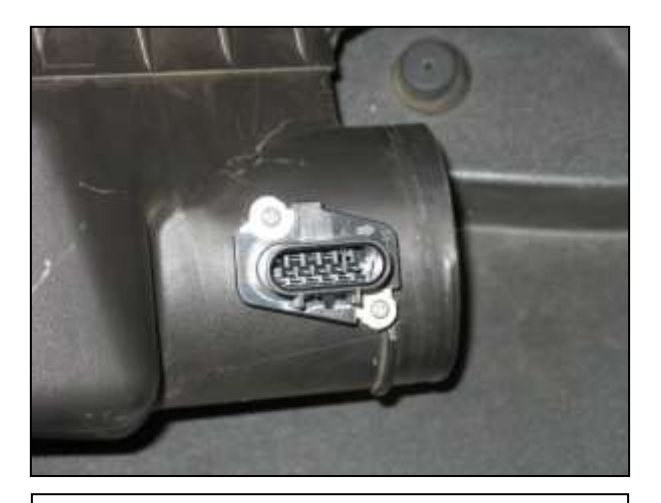
f. Remove the MAF sensor from the factory air box lid.