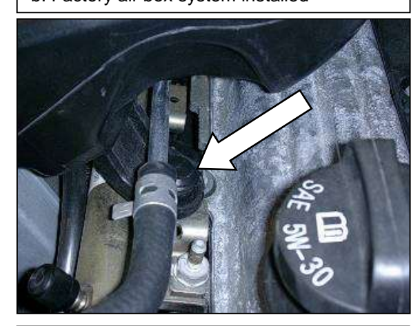
d. After removing the engine cover you will gain access to a plastic retainer near the fuel rail. Pry it open to being removal of stock air ducting.