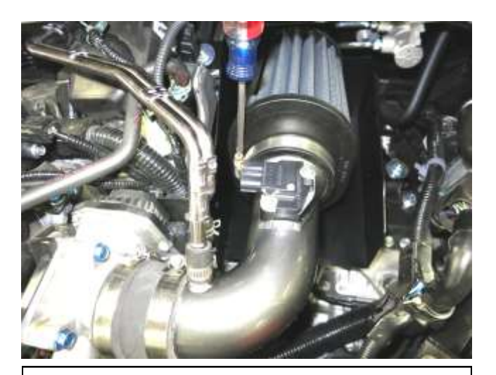
k. Align the filter vertically and tighten the hose clamp to secure its position.