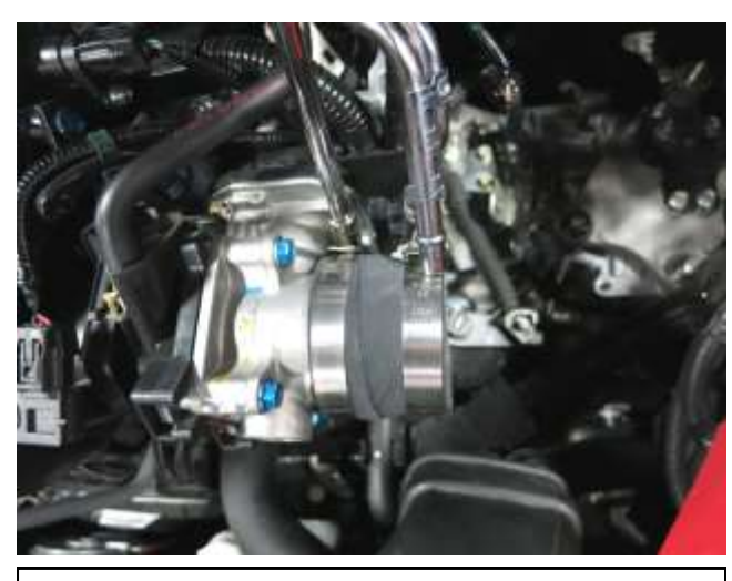
b. Install the transition coupler(08476) and fasten the hose clamp(AEM-9440) over the throttle. Slide loose hose clamp(AEM-9436) over the other coupler end.