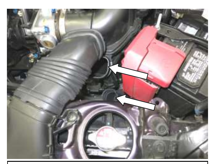
a. Disconnect the upper and lower air inlet ducts from the lower intake box.