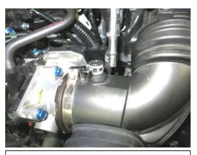
b. Depress the spring clamp on the intake tube to disconnect the hard breather line as shown.