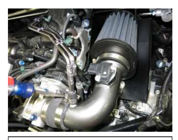
j. Adjust tube positon if needed and fasten the hose clamp on the coupler.