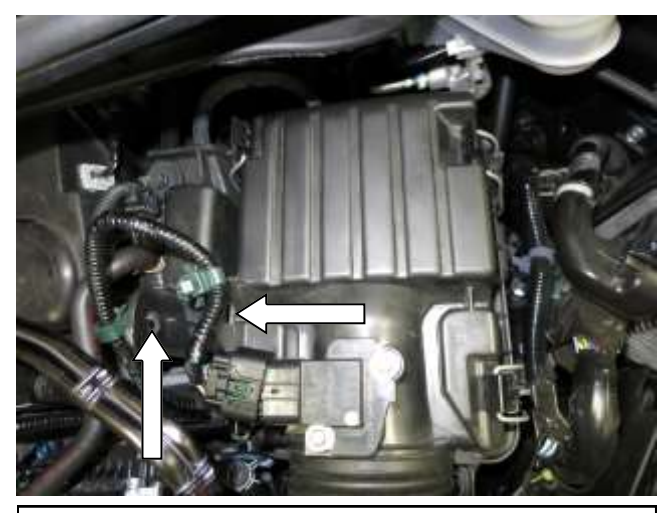
c. Disconnect the MAF harness from the connector. Unclip the two green tree-mount ties from upper airbox.