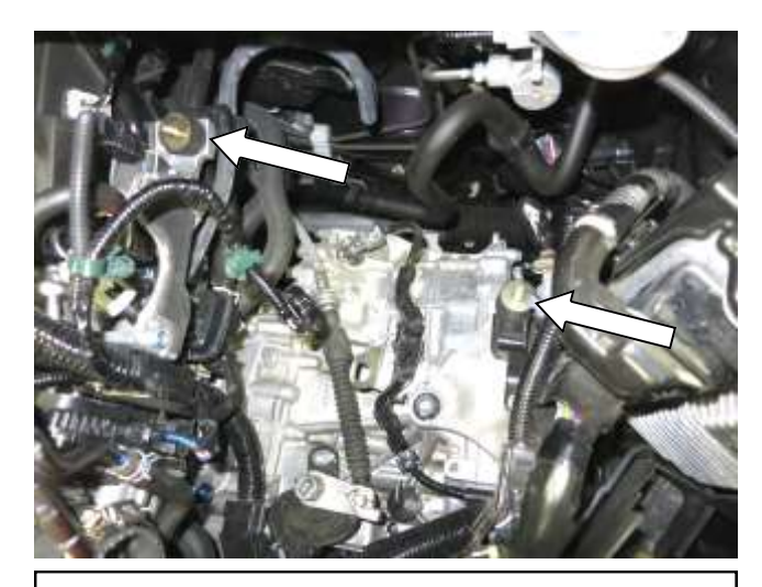
c. Install the two rubber mounts(AEM-1228598) onto the stock airbox mounting locations as indicated.