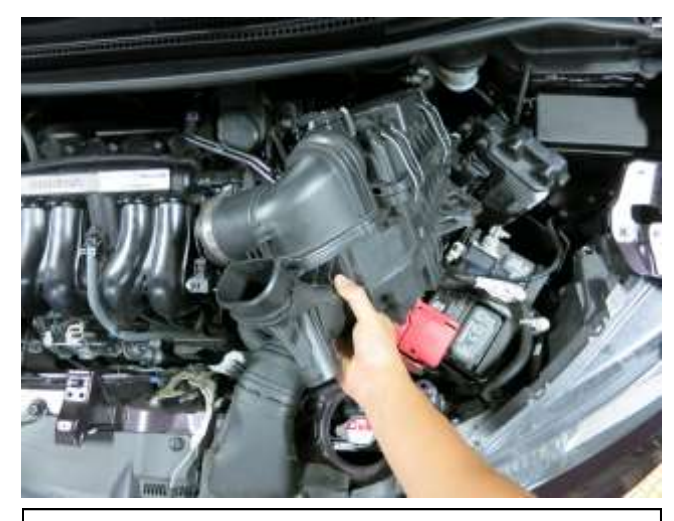
e. Carefully remove the stock intake assembly from the engine bay.