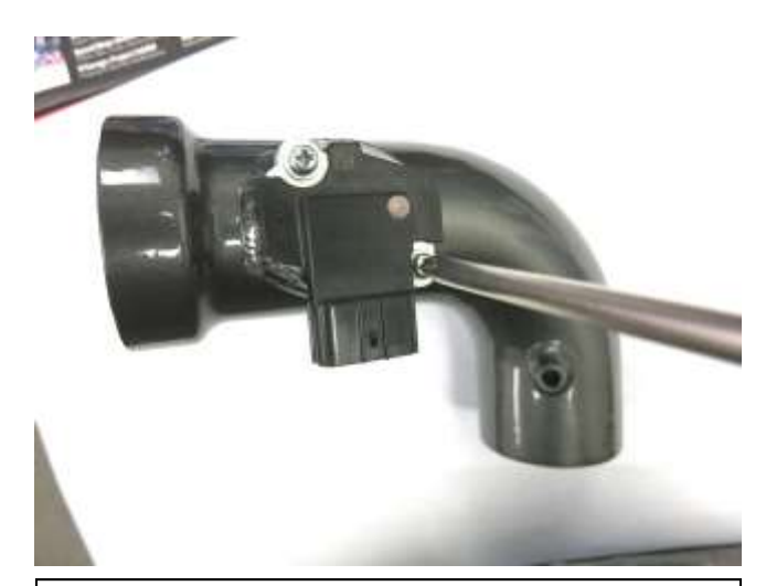
a. Use the stock screws removed in step 2f to fasten the MAF sensor into the AEM tube.

a. When installing the intake system, do not completely tighten the hose clamps or mounting hardware until instructed to do so.