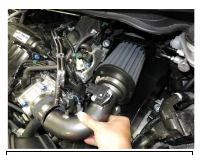
g. Insert the intake tube into the coupler and align the lower rubber mount to the lower bracket.