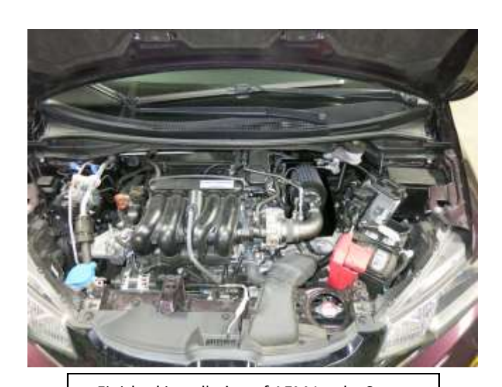
p. Finished installation of AEM Intake System.