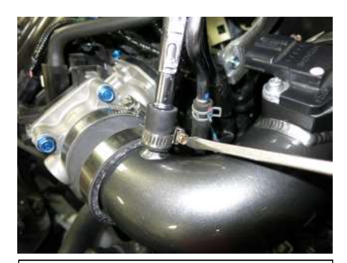
h. Connect the breather line to the intake tube using the hose(AEM-5-1002) and fasten hose clamp(AEM-4093-5). The hose may need top be trimmed for proper fitment.