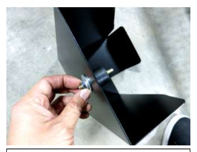
d. Install the rubber mount(AEM-1228599) onto the heat shield(20-8545) as shown and fasten with the provided washer(08160) and nut(AEM-460.04).