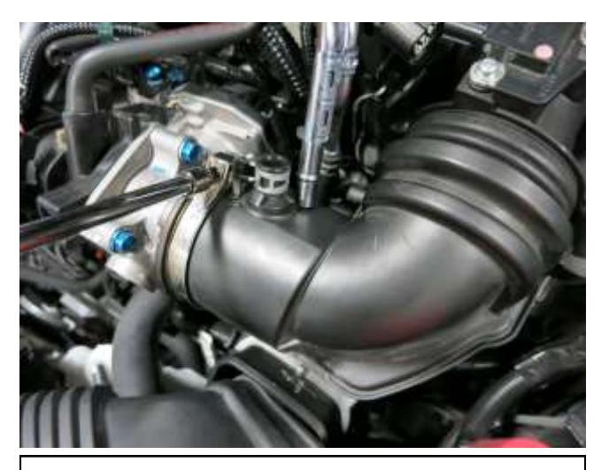
d. Loosen the hose clamp securing the intake tube to the throttle using a 8mm socket.