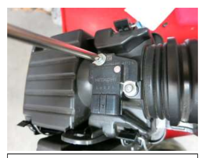
f. Use a phillips screwdriver to remove the MAF sensor. Set aside the stock screws for use with the AEM tube.