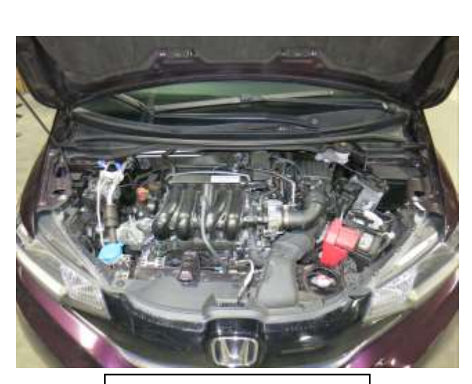
o. Factory air induction system.