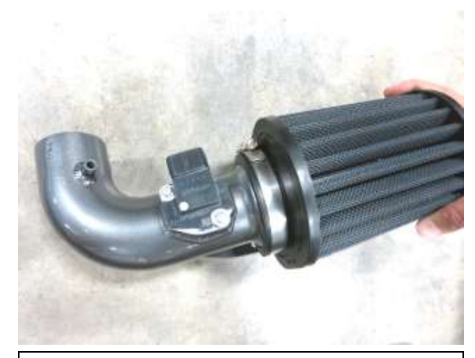
f. Install AEM filter(AEM-2127D) onto the intake tube with the hose clamp(AEM-9448) loosely fastened.