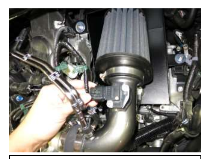
I. Reconnect the MAF harness to the sensor.