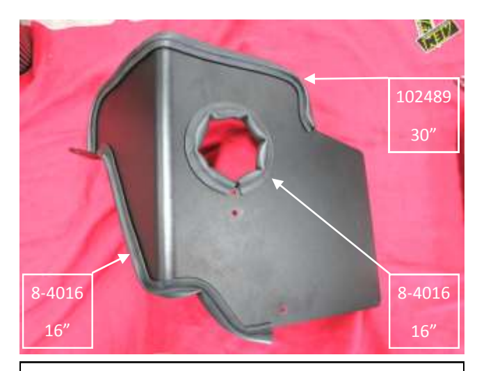
b. Install the provided edge trims onto the heat shield.