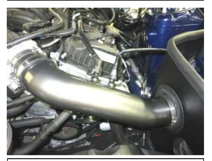
g. Slide the 2 vent lines onto the adapters, making sure you hear a click to confirm they are attached. Manual transmissions will only connect 1 vent line.