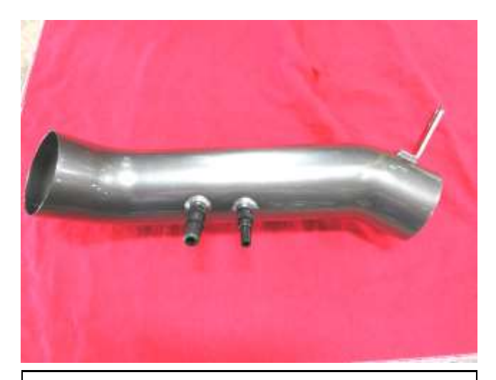
a. Install the two provided vent adapters into the tube as shown. Manual transmissions will use the plug provided instead of the vent adapter on the right side. Install finger tight, then a 1/4 turn with a wrench.

a. When installing the intake system, do not completely tighten the hose clamps or mounting hardware until instructed to do so.