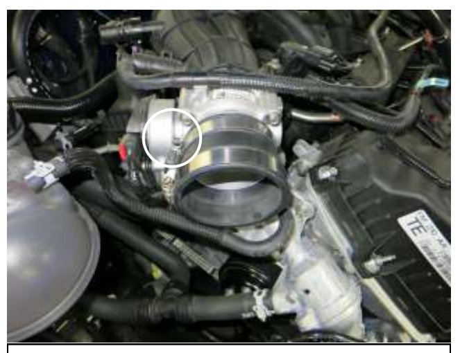
f. Install the coupler onto the throttle body with the provided hose clamps and tighten the one closest to the throttle body.