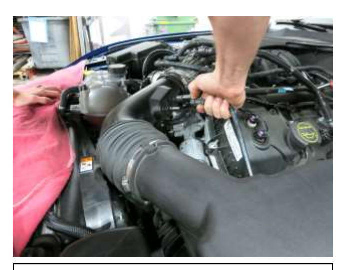
d. On automatic transmissions depress the gray clip and pull the second vent line from the stock intake. Manual transmissions will not have this vent line. Then remove the stock intake and air box from the vehicle.