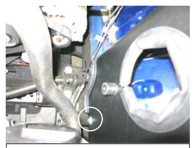
e. Using the provided M8 bolt and washer, tighten the heat shield to the vehicle where shown.