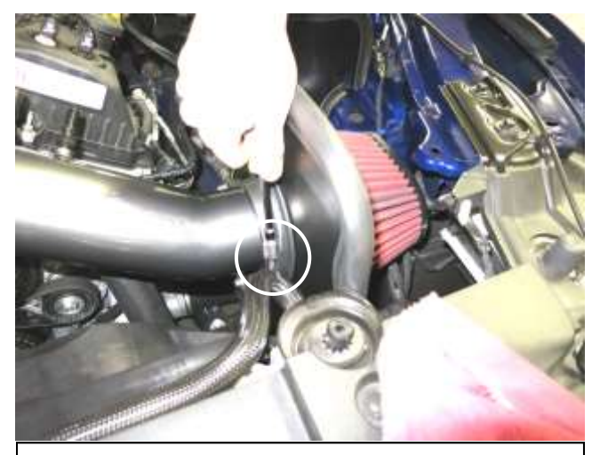
\ensuremath{k}. Slide the hose clamp over the filter and tighten at this time.