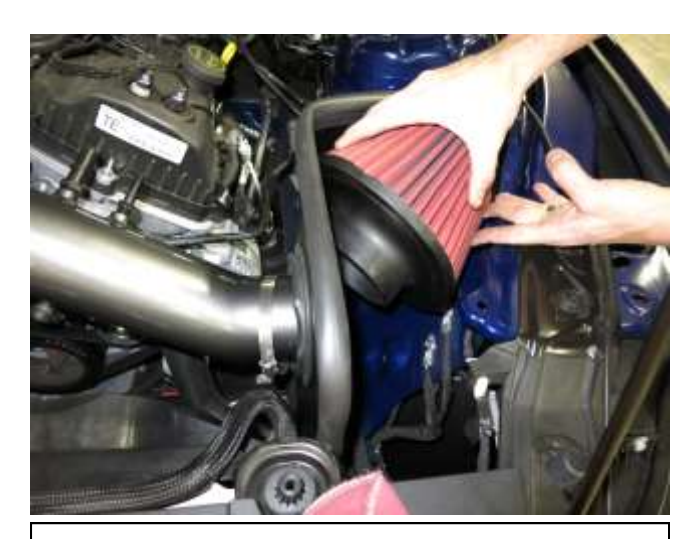
j. Install the hose clamp over the AEM intake tube and slide the AEM filter onto the tube as shown.