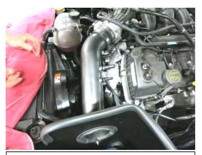
g. Install the AEM intake tube into the coupler and the heat shield opening.