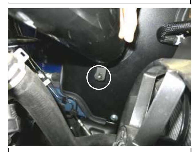
h. align the AEM intake bracket with the rubber mount.