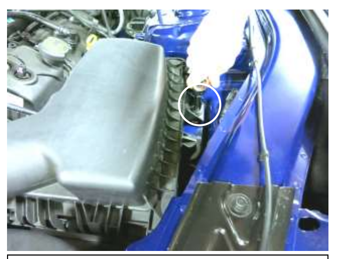
b. Remove the bolt securing the air box to the vehicle. This will be reused in step 3d.