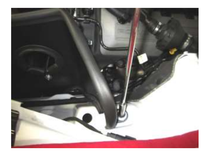
d. Install the completed heat shield into the vehicle. With the bolt removed in step 2b. install the provided washers and tighten the heat shield to the vehicle.