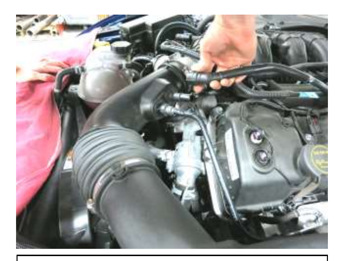
c. Unlatch the gray clip on the connector and pull the vent line from the stock intake tube.