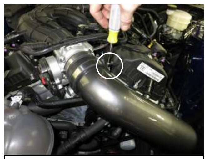
I. Tighten the other hose clamp furthest from the throttle body at this time.