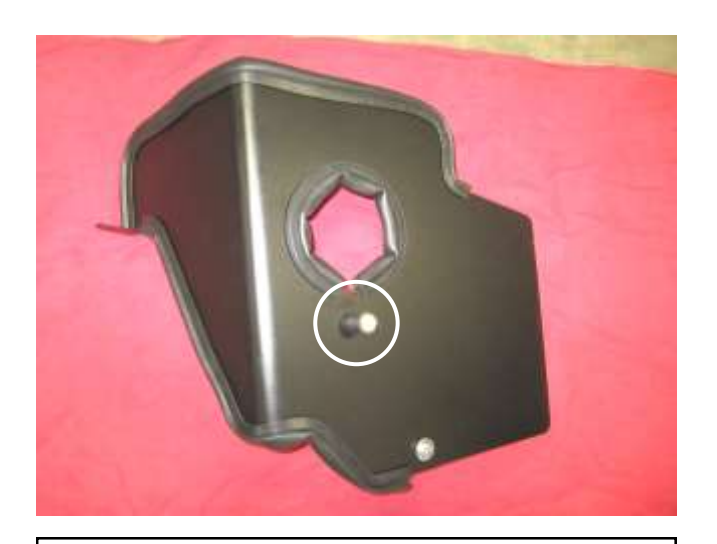
c. Assemble the heat shield as shown according to the component list on page 2.