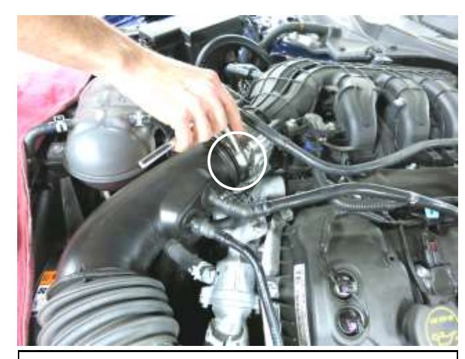
a. Loosen the hose clamp at the throttle body.