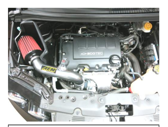
AEM INTAKE INSTALLED