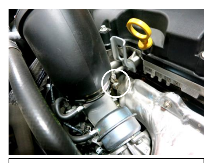
b. Loosen the hose clamp at the turbo compressor inlet.