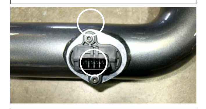
g. Install the mass air flow sensor into the AEM intake tube that was removed in step 2f. and secure with the provided hardware.