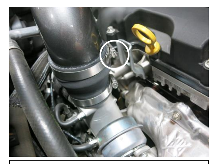
Install the AEM intake tube into the vehicle aligning the tube with the coupler. Tighten the hose clamp (circled above) at this time.