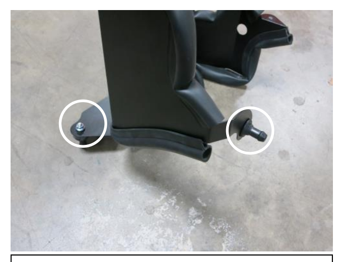
c. Install the provided hardware onto the AEM heat shield as shown. See the diagram on page 2 for parts and part number references.