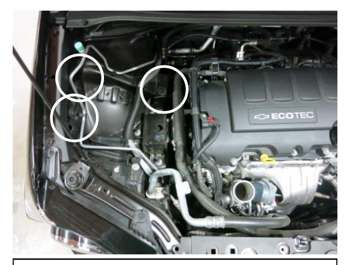
c. Remove the stock air intake. There are three push-in mounts securing the lower air box to the vehicle. Note: Do not discard any of your stock equipment.