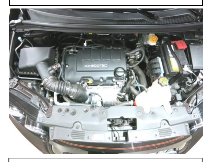
STOCK INTAKE INSTALLED