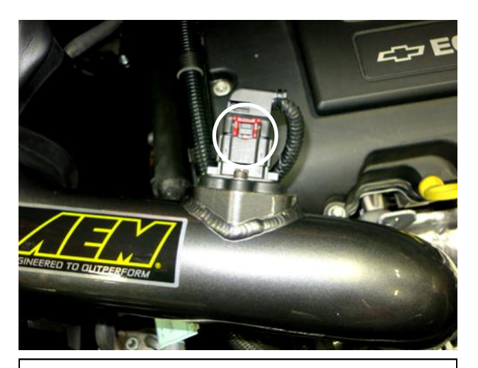
j. Reconnect the mass air sensor connector onto the mass air sensor. Engage the red locking tab.