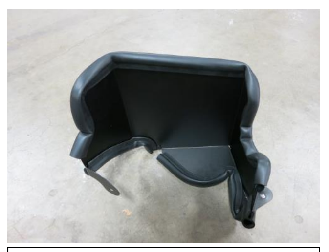
b. Install the edge trim onto the AEM heat shield as shown, trim to fit if desired.