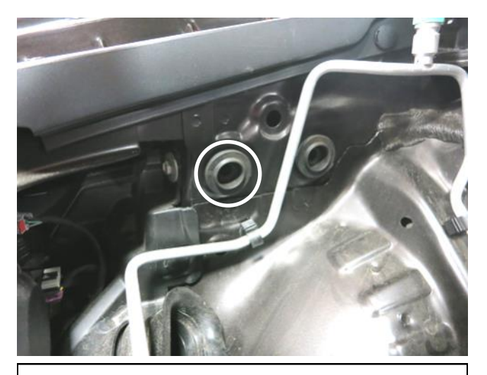
e. Remove the rubber grommet from the inner fender of the vehicle. This will be reused in step 3a.