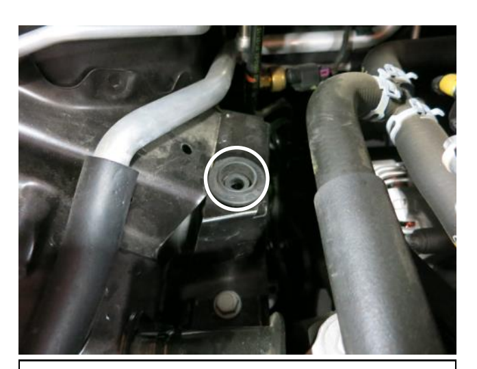
a. Take the rubber grommet that was removed in step 2e. and install it into the same location the rubber grommet in step 2d. was removed.

When installing the intake system, do not completely tighten the hose clamps or mounting hardware until instructed to do so.