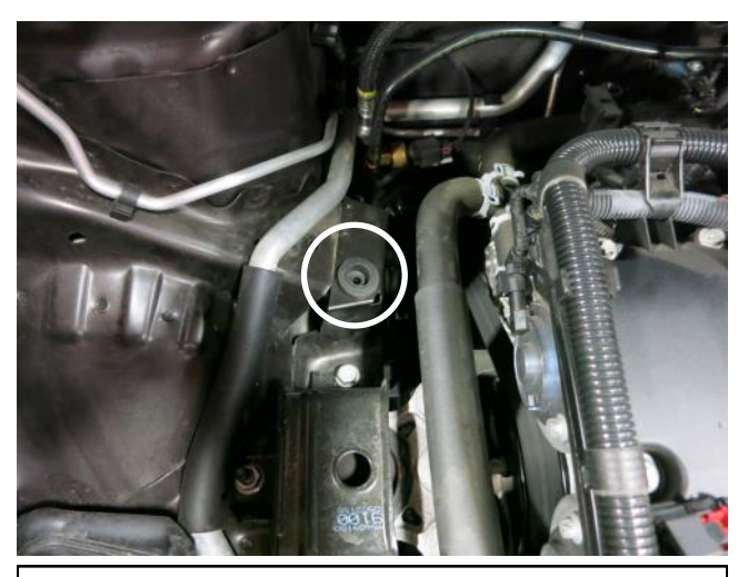
d. Remove the rubber grommet from the vehicle. This will not be reused.