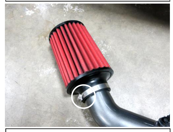
h. Install the AEM filter onto the AEM intake tube and secure with the provided hose clamp.