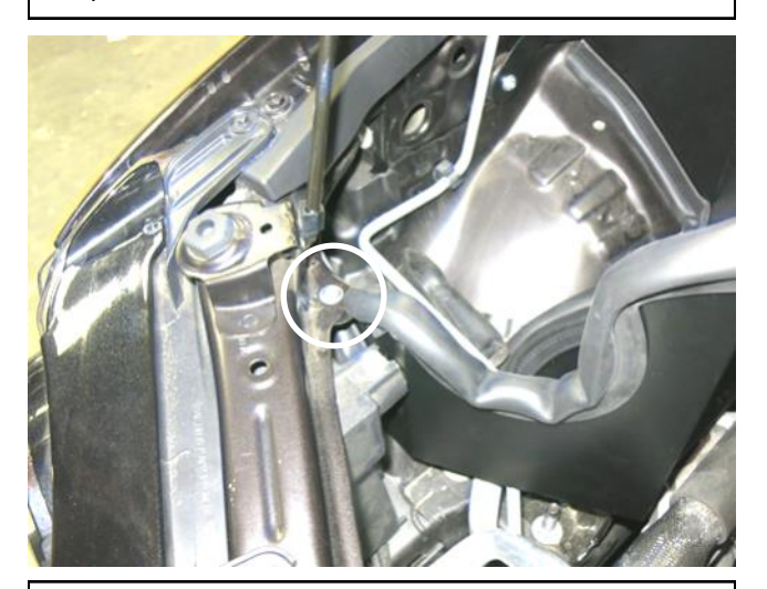
e. Make sure the AEM heat shield is under the lip of the core support, and install the provided bolt/nylon washer securing the AEM heat shield to the vehicle. NOTE: On vehicles equipped with projector head lights it will be necessary to install the bolt from the bottom up.