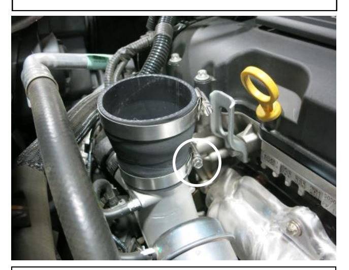
f. Install the coupler and provided hose clamps on to the turbo compressor inlet. Tighten the hose clamp closest to the compressor at this time.