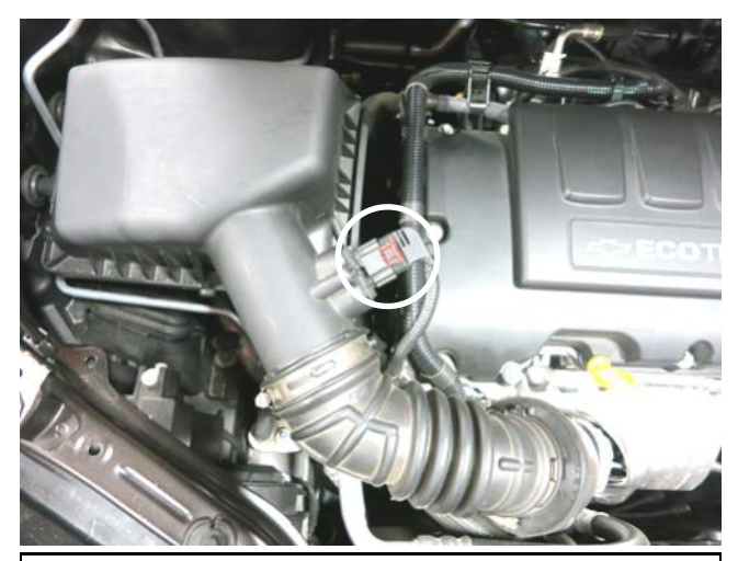
a. Release the red tab on the mass air sensor connector and disconnect the connector from the sensor.