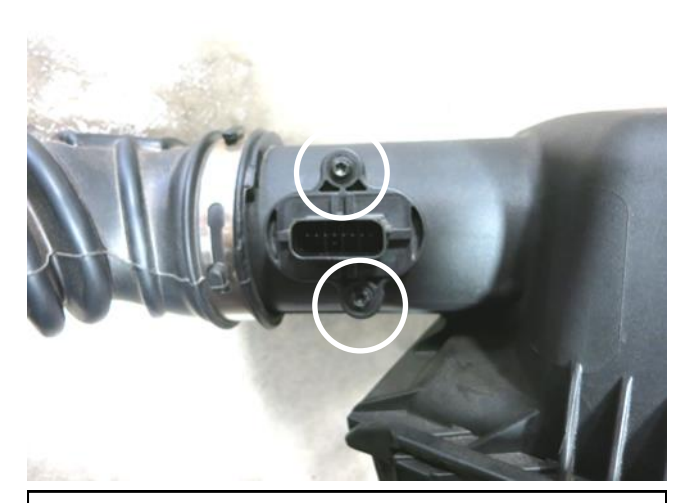
f. Remove the two screws securing the mass air sensor to the stock upper air box. The screws will not be reused, however the mass air sensor will be reused in step 3g.