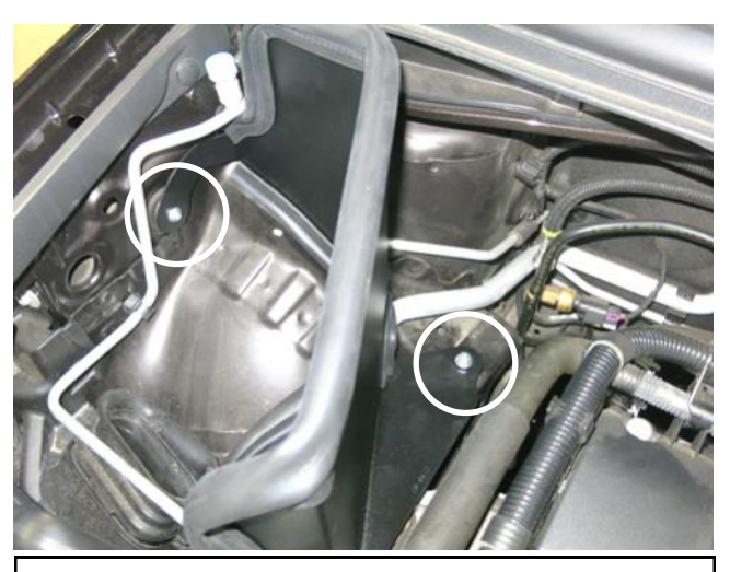
d. Install the completed AEM heat shield into the vehicle aligning the mount on the inner fender and rear rubber grommet.