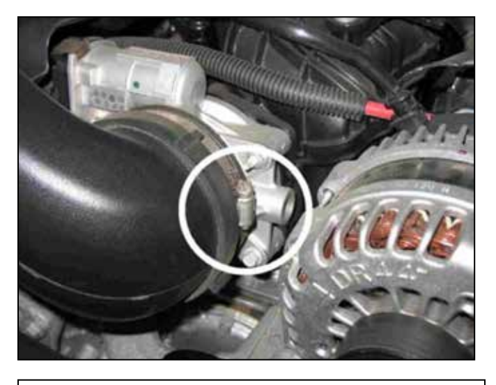
c. Loosen the hose clamp located at the throttle body.

a. Stock air system installed system. Pull engine cover off.