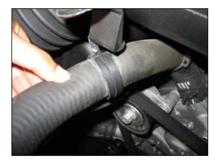
d. Pull the plastic radiator hose tree mount out of the stock intake tube holder.