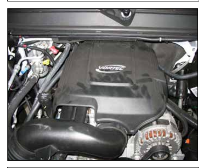
Factory air box system installed

n. Insert tree mount into intake pipe bracket, secure radiator overflow hose to tree mount.