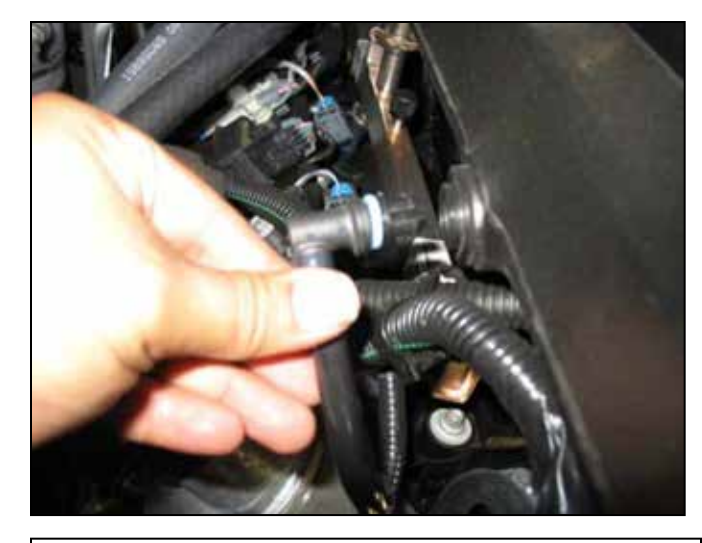
b. Pull out the breather hose out of the resonating chamber in the stock air box system.