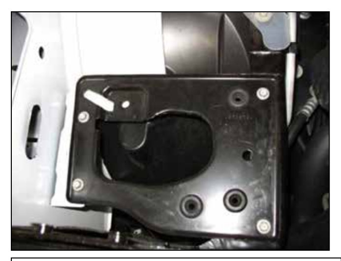
h. Remove the four bolts securing the stock air box mounting plate.

f. Pull the stock inlet tube out of the vehicle. Loosen the hose clamp securing the MAF housing to the air filter, remove MAF housing, keep for later reuse.