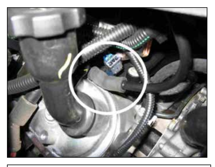
i. Remove the breather hose from the valve cover.

g. Pull the stock air filter housing straight up out of the vehicle.