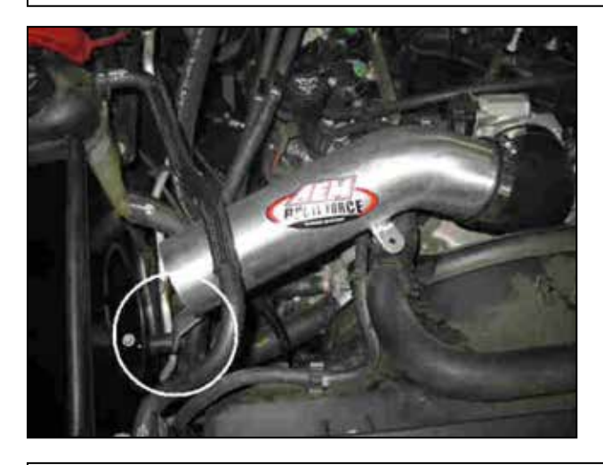
e. Insert intake pipe into elbow located at the throttle body. Secure the bracket to the rubber mount on the heatshield.