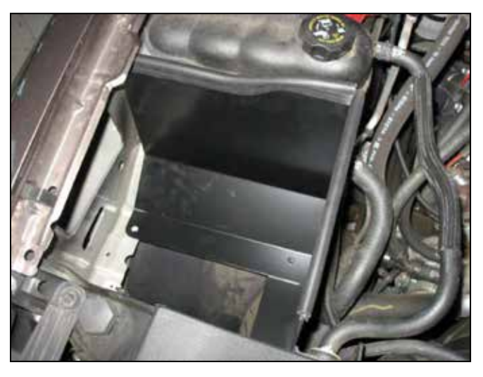
c. Install the heat shield using the three stock bolts used to secure the air filter box mounting plate.

d. Install the elbow onto the throttle body, and loosely put the supplied hose clamps on the ends.