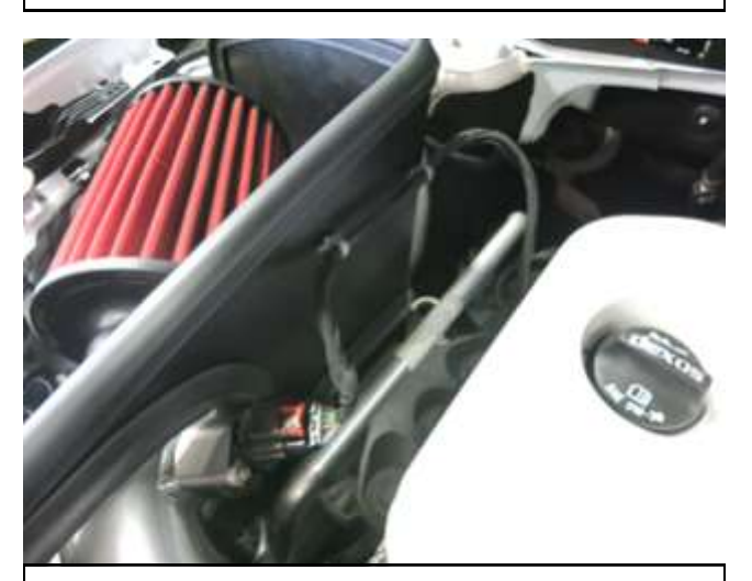
I. Connect the MAF connector to the MAF sensor and secure the harness with the factory ties into the holes on the heatshield. The ties may need to be repositioned for best fit.