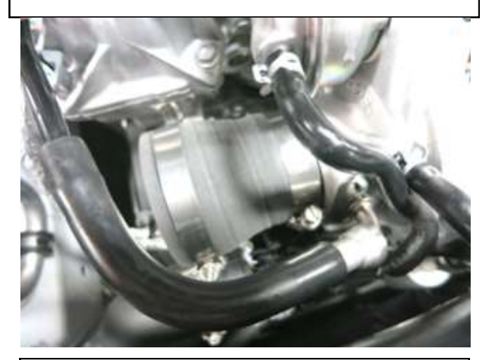
e. Install the provided coupler with the small end at the turbo. Use the provided hose clamps. Open the hose clamps all the way prior to installation. Tighten the turbo side clamp at this time to 30 in-lb.