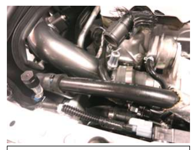
g. Maneuver the fitting on the intake tube past the vacuum line as show. Ensure the intake tube is fully seated into the big end of the coupler. Soapy water can help with installation.