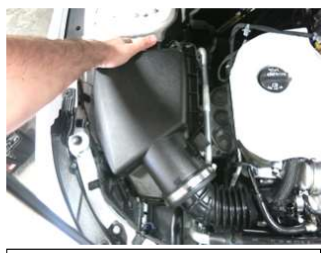
d. Release the air box from its rubber grommets by pulling up gently on the air box as shown.