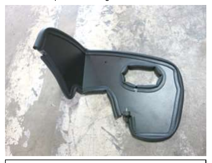
b. Assemble the heat shield with the edge trim, rubber mount, and nylon air box mount. Use a 12mm wrench to tighten the air box mount.