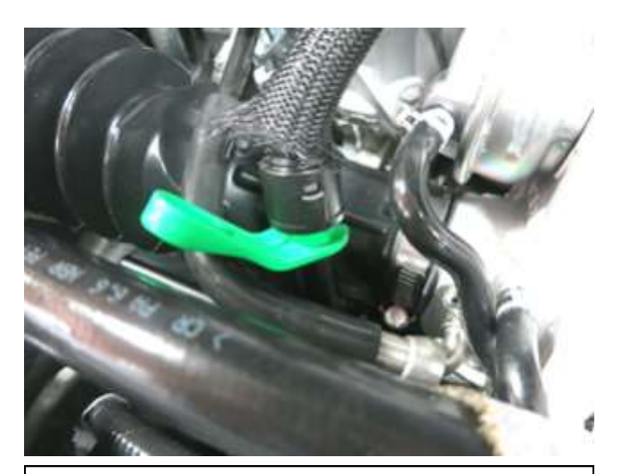
b. Use a 5/8" AC/fuel line disconnect tool to release the PCV connection. Pull the PCV line free and away from the fitting.