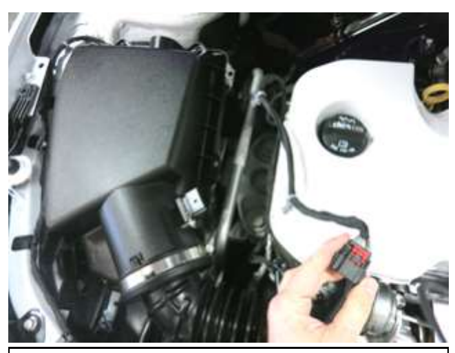
a. Disconnect the Mass Air Flow (MAF) sensor connector and harness ties from the sensor and air box.