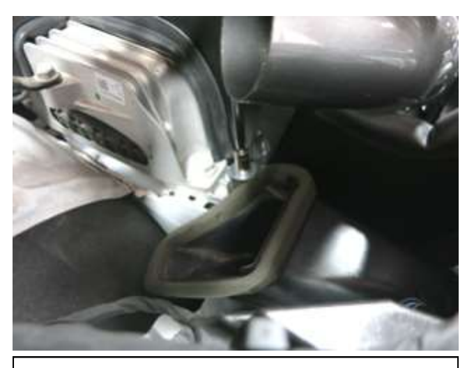
h. Fully tighten the intake tube bracket to the rubber mount at this time.