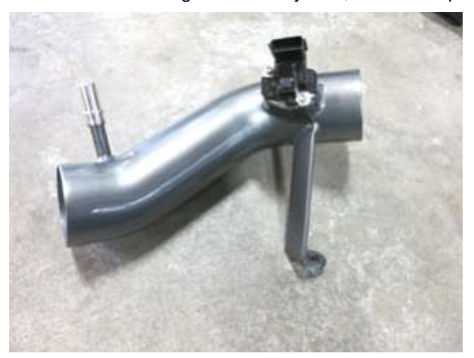
a. Install the MAF sensor into your AEM intake tube using the provided screws.

a. When installing the intake system, do not completely tighten the hose clamps or mounting hardware until