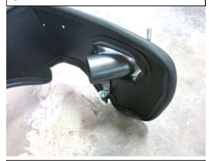
d. Install the AEM intake tube into the heatshield and loosely secure with the provided nut and washer as shown.