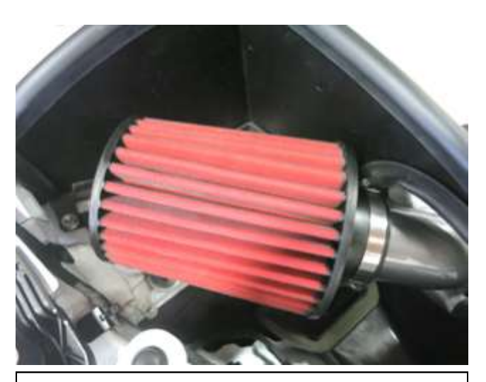
j. Install the AEM Dryflow filter using the provided hose clamp. Tighten the clamp to 30 in-lb.