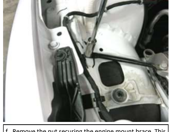
f. Remove the nut securing the engine mount brace. This nut will be reused in step 3i.