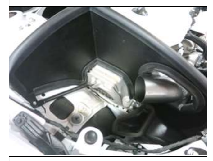
f. Install the assembly into the car as shown . Push the heatshield mount into the grommet and align the tab with the engine brace stud. Guide the intake tube into the coupler as shown in step 3g.