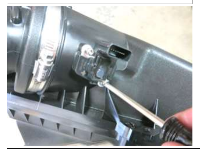
g. Remove the MAF sensor from the air box using the T20 Torx bit. The MAF sensor will be reused in step 3a. Do not discard any of your stock equipment!