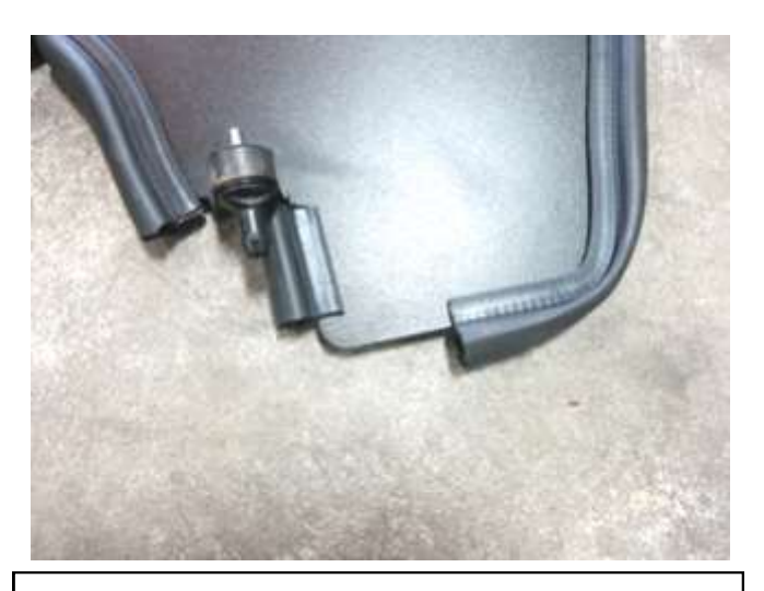
c. The edge trim may need to be trimmed as shown to clear the AC line bracket. You may temporarily install the heatshield and close the hood to check for clearance issues.