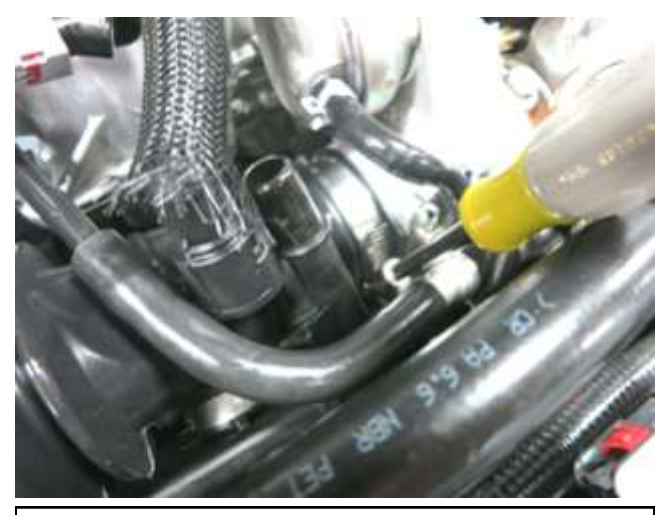
c. Loosen the hose clamp at the turbo side of the factory air hose.