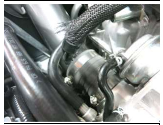
k. Connect the PCV line to the fitting on the intake tube. Ensure it clicks into place and is securely attached.