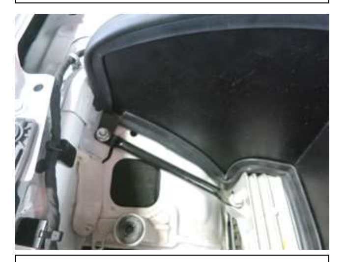
i. Using the nut removed in step 2f, secure the heat-shield to the inner fender.