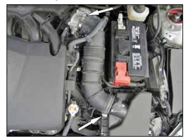
5. Loosen the hose clamps that secure the intake tube to the throttle body and air filter housing, unhook the vent lines attached to the intake tube and then remove the tube from the vehicle.