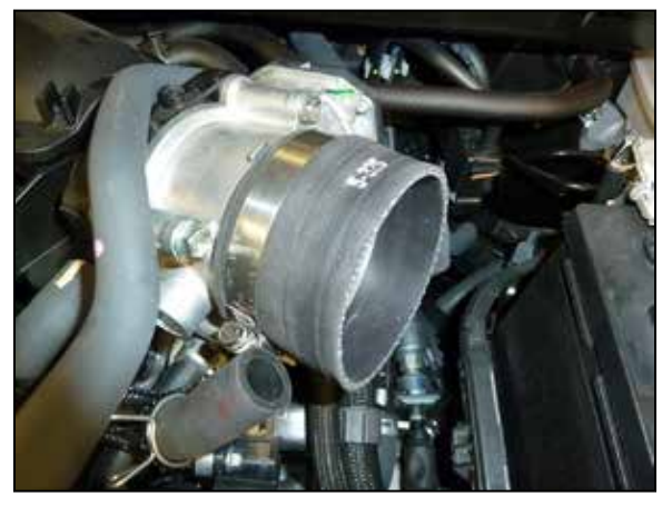
12. Install the provided coupler hose (5-326) onto the throttle body and secure with the provided hose clamp.