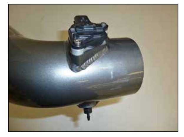
15. Remove the mass air sensor from the factory air filter housing and install it into the AEM® intake tube using the provided hardware. Install the provided vacuum fitting into the AEM® intake tube. NOTE: Plastic NPT fittings are easy to cross thread. Install the vent fitting "hand" tight, then turn it two complete turns with a wrench.