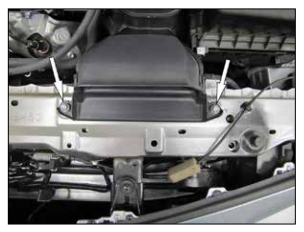
3. Remove the two bolts that secure the fresh air intake duct and then remove the duct from the vehicle.