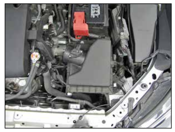
6. Lift up the air filter housing to dislodge it from the mounting grommets and then remove the housing from the vehicle.