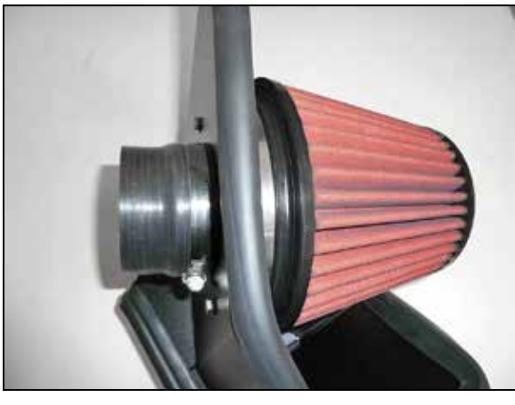
10. Install the provided air filter and coupling hose (5-352) onto the filter adapter and secure with the provided hose clamps.