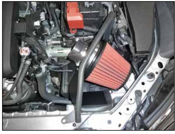
11. Install the heat shield assembly into the vehicle so the mounting studs engage the factory mounting grommets.