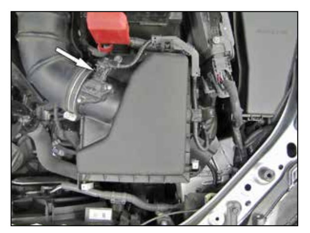
4. Disconnect the mass air sensor electrical connection and unclip the wiring harness from the air filter housing.