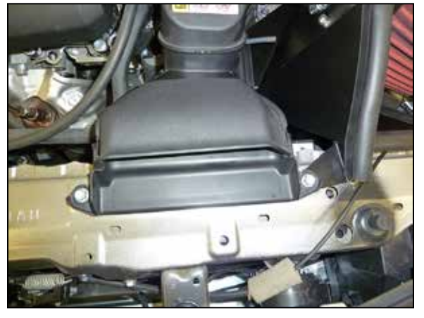
13. Install the fresh air intake duct and secure with the factory hardware.

8. Cut the provided top bulb edge trim into sections of 21-1/2", 16" and 14" and then install them onto the heat shield as shown.