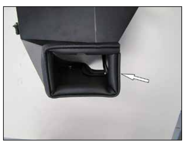
9. Install the side bulb edge trim onto the heat shield as shown.