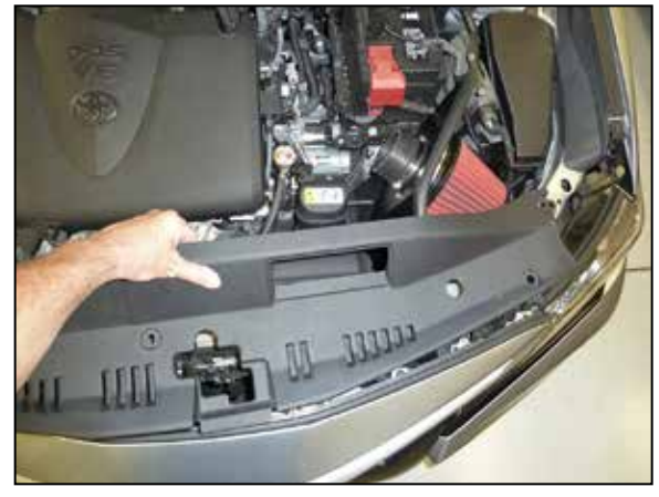
14. Reinstall the radiator cover and secure with the factory push clips.