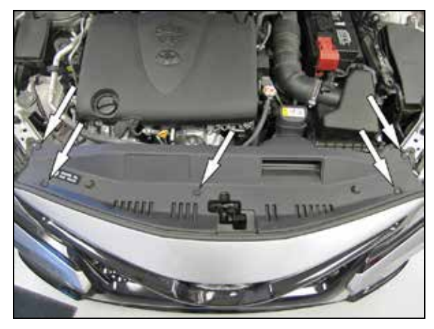
2. Remove the five push pins that secure the radiator cover and then remove the radiator cover.

NOTE: Disconnecting the negative battery cable erases pre-programmed electronic memories. Write down all memory settings before disconnecting the negative battery cable. Some radios will require an anti-theft code to be entered after the battery is reconnected. The anti-theft code is typically supplied with your owner's manual. In the event your vehicles anti-theft code cannot be recovered, contact an authorized dealership to obtain your vehicles anti-theft code.