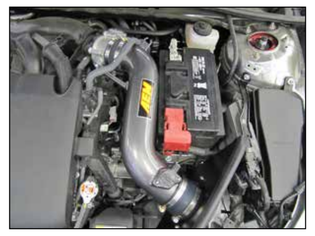
16. Install the AEM<sup>®</sup> intake tube into the Coupling hoses, adjust the tube for best fit and then secure with the provided hose clamps.