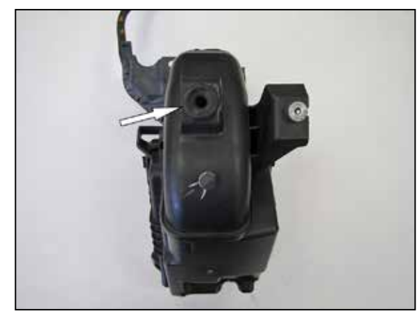
6. Remove the factory air filter housing mounting grommet from the factory housing.

5. Install the two rubber mounted studs to the air filter housing mounting locations. Remove the plastic harness holder from the mass air sensor wiring harness and then install the provided split loom harness cover. Tape the ends of the harness cover with electrical tape.