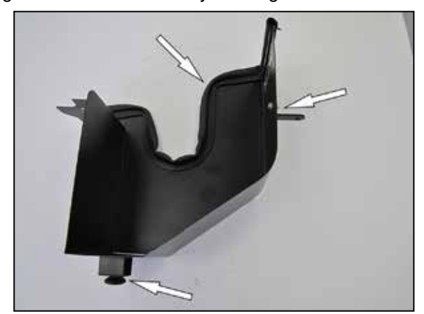
7. Install the factory mounting grommet, mounting bracket (064356) and edge trim onto the heat