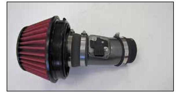
12. Install the AEM<sup>®</sup> air filter onto the filter adapter