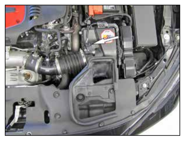
2. Disconnect the mass air sensor electrical connection and unhook the wiring harness from the air filter housing.

NOTE: Disconnecting the negative battery cable erases pre-programmed electronic memories. Write down all memory settings before disconnecting the negative battery cable. Some radios will require an anti-theft code to be entered after the battery is reconnected. The anti-theft code is typically supplied with your owner's manual. In the event your vehicles anti-theft code cannot be recovered, contact an authorized dealership to obtain your vehicles anti-theft code.