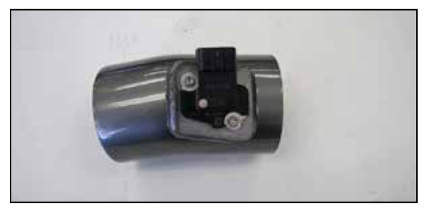
9. Remove the mass air sensor from the factory housing and install into the AEM<sup>®</sup> intake tube and secure with the provided hardware.