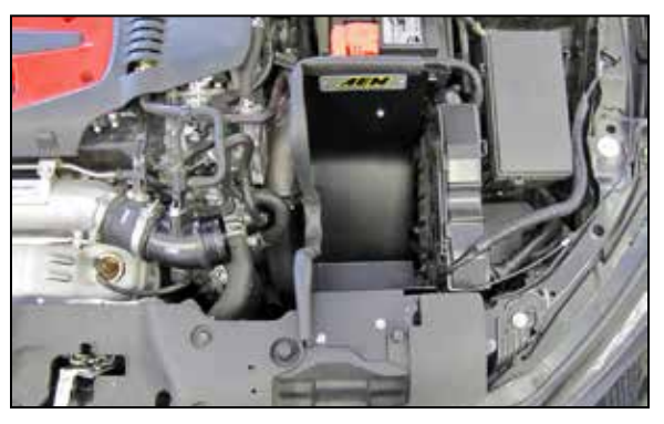
8. Set the heat shield into position on the rubber mounted studs and mounting stud. Secure the heat shield with the provided hardware.