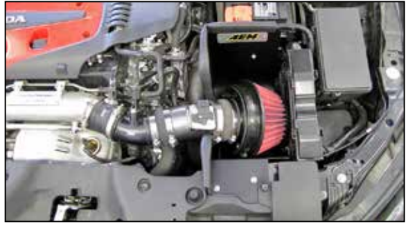
13. Install the intake tube assembly onto the turbo inlet, adjust the assembly for best fit and then secure with the provided hose clamp.