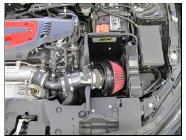
14. Reconnect the mass air sensor electrical connection.