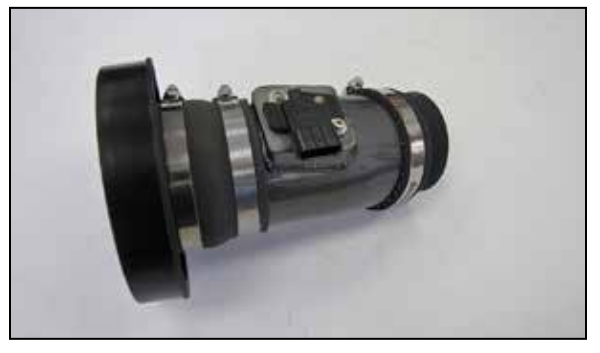
11. Install the filter adapter assembly onto the AEM<sup>®</sup> intake tube and secure with the provided hose clamp. Install coupler 084034 onto the AEM<sup>®</sup> intake tube and secure with the provided hose clamp.

10. Install the provided coupler (084091) onto the filter adapter and secure with the provided hose clamp.