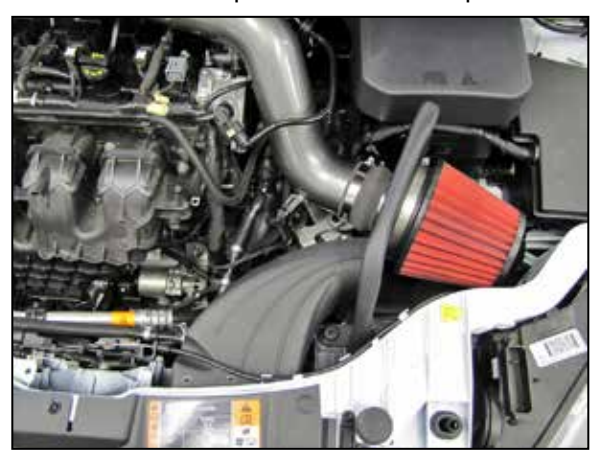
20. Install the AEM® fresh air duct onto the core support and into the AEM® heat shield.