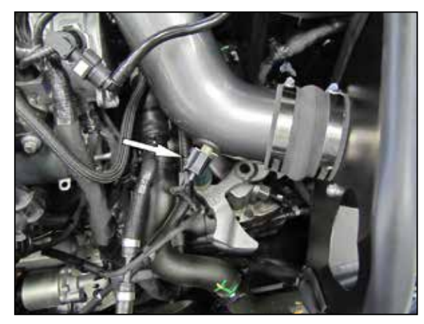
18. Reconnect the inlet air temperature sensor electrical connection.