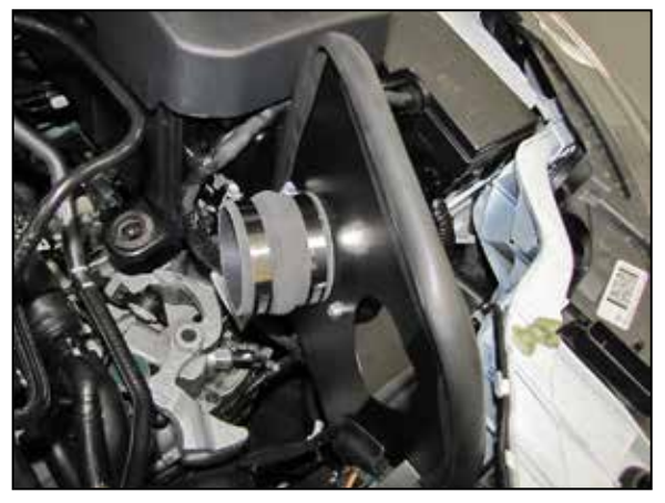
14. Install the provided coupler hose (087121) onto the filter adapter and secure with the provided hose clamp.