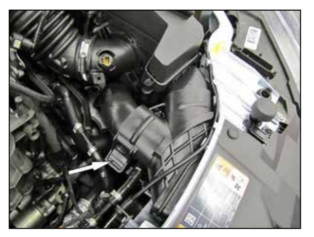
5. Release the inlet air duct from the air box.