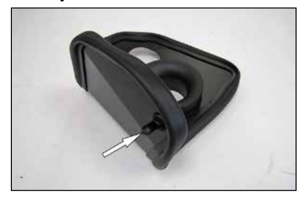
10. Install the heat shield mounting stud onto the heat shield and secure with the provided hardware.

NOTE: Some trimming of the edge trim will be necessary.