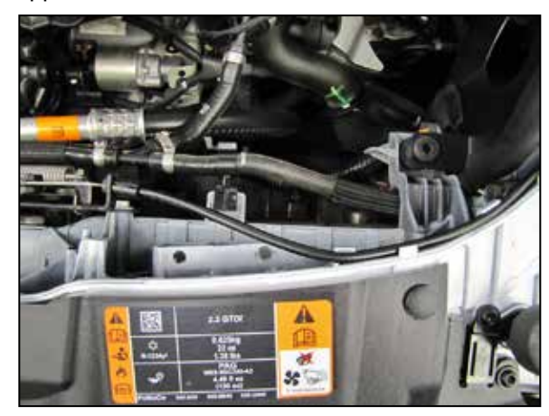
21. Using the Fresh air duct as a guide, mark the two hole locations onto the fresh air duct in the core support. Next remove the AEM® fresh air duct and drill two 1/4"id holes into the factory fresh air duct at the marked locations.