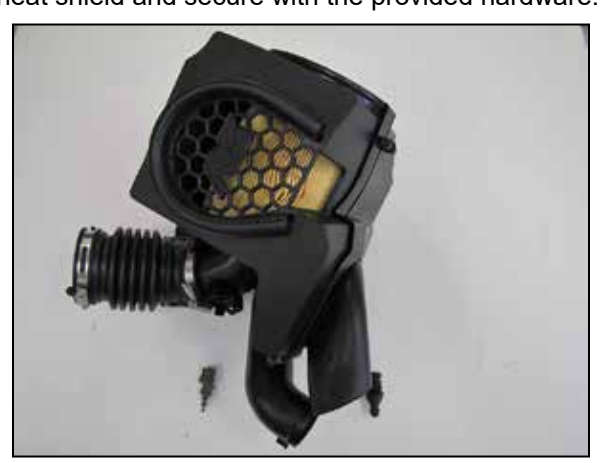
11. Remove the inlet air temperature sensor and mounting post from the factory air box.