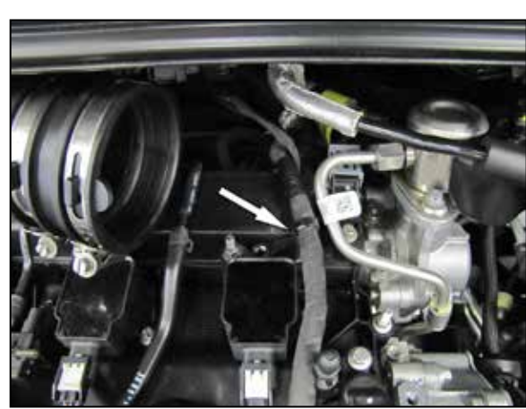
16. Unhook the wiring harness clip from the mounting stud, route the harness next to the coil and fuel line and secure the harness to the fuel line with the provided tie wrap.