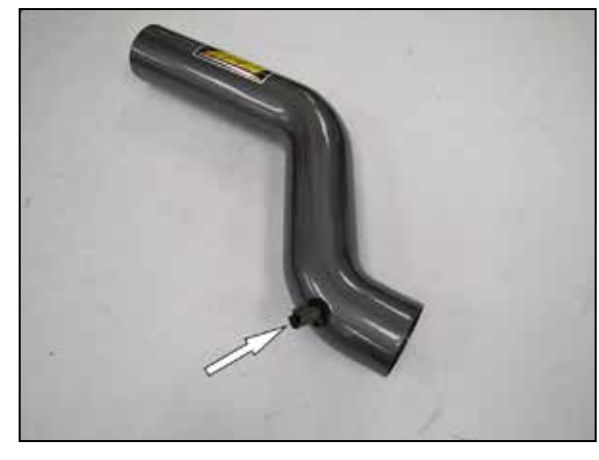
15. Install the grommet provided and the factory inlet air temperature sensor into the AEM® intake tube as shown.