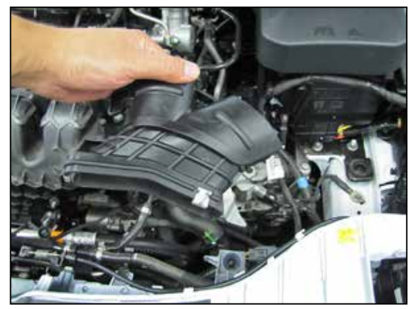
7. Remove the inlet air duct from the core support.