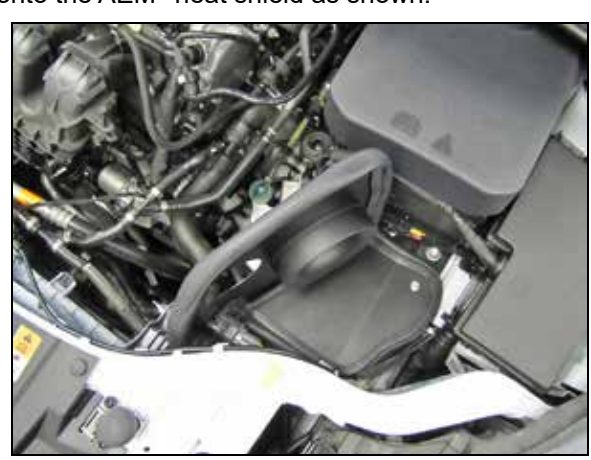
13. Install the heat shield assembly into the vehicle so the mounting studs insert into the grommets.