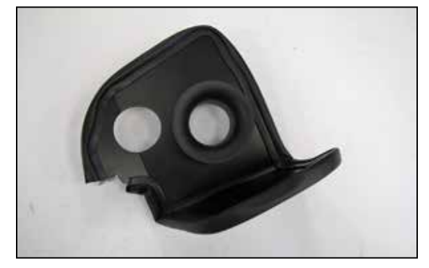
9. Install the provided edge trim onto the heat shield.

NOTE: Some trimming of the edge trim will be necessary.