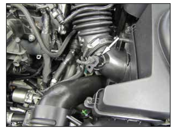
4. Disconnect the inlet air temperature sensor electrical connection.