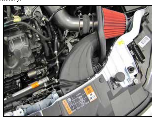
24. Install the AEM® fresh air duct into the heat shield and core support as shown and secure with the two provided retaining clips.

NOTE: be sure to check the hood release cable to see if it became unhooked during the duct assembly and attach if necessary.