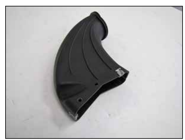
23. Install the two clips from the previous step onto the AEM® fresh air duct in the same position as the