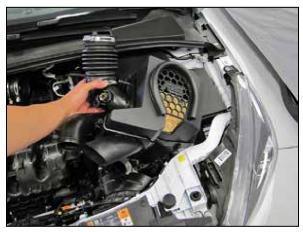
6. Lift and dislodge the air box from its mounting grommets and then remove the air box from the vehicle.