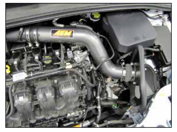
17. Install the AEM® intake tube into the factory coupler and then into the AEM® coupler, adjust the tube for best fit and then secure with the provided hose clamps.