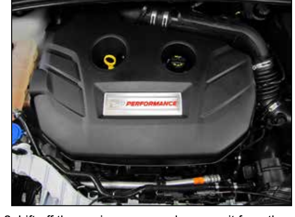
2. Lift off the engine cover and remove it from the vehicle.

NOTE: Disconnecting the negative battery cable erases pre-programmed electronic memories. Write down all memory settings before disconnecting the negative battery cable. Some radios will require an anti-theft code to be entered after the battery is reconnected. The anti-theft code is typically supplied with your owner's manual. In the event your vehicles anti-theft code cannot be recovered, contact an authorized dealership to obtain your vehicles anti-theft code.