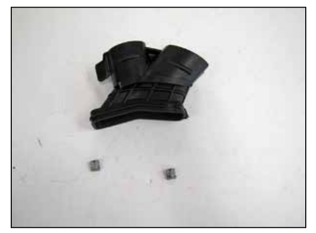
22. Remove the two clips from the factory inlet air