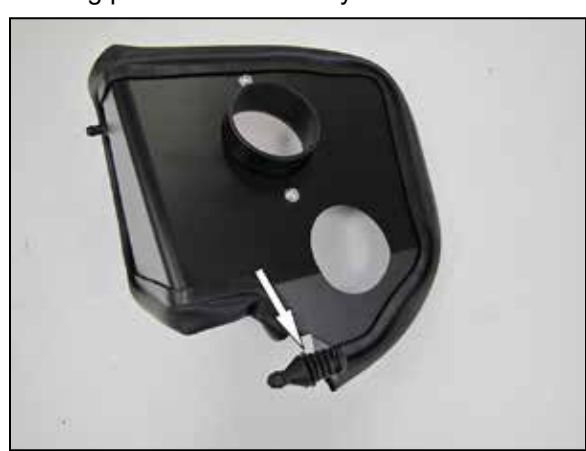
12. Install the mounting post from the previous step onto the AEM^{\otimes} heat shield as shown.