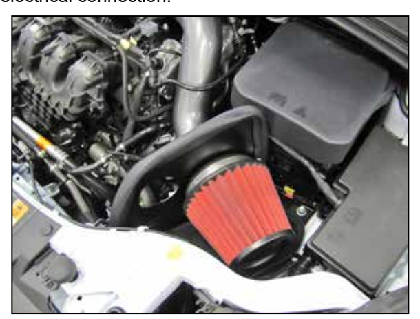
19. Install the AEM® air filter onto the filter adapter and secure with the provided hose clamp.