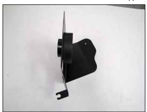
8. Install the filter adapter into the heat shield and secure with the provided hardware.