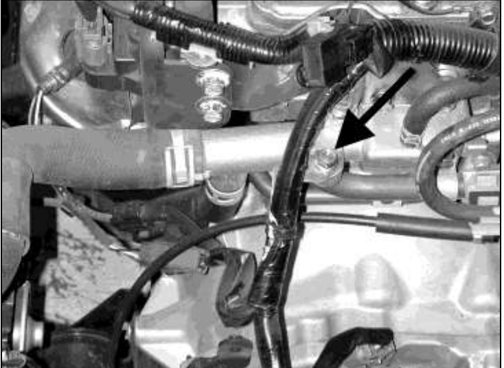
Fig. 2 Fig. 3