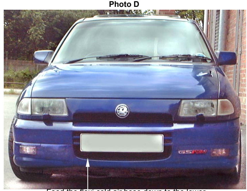
Feed the flexi cold air hose down to the lower grille and secure with a long plastic tie.