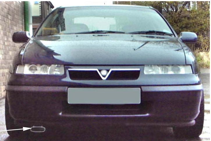
Pierce / drill two 3mm holes in the front bumper trim, secure to the front bumper using 2 plastic ties. Insert the flexi cold scoop, secure the scoop to a hole in the cross member with