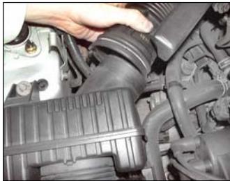
Fig. # 1

FILTER MAINTENANCE: K&N suggests checking the filter periodically for excessive dirt build-up. When the element becomes covered in dirt (or once a year), service it according to the instructions on the Recharger service kit available from your K&N dealer, part number 99-5000 or 99-5050.