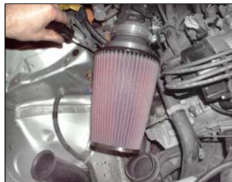
Fig. # 9