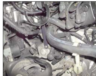
Fig. # 6