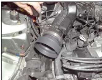
Fig. # 8