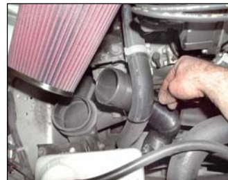
Fig. # 10