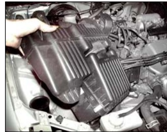
Fig. # 3