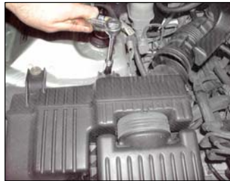
Fig. # 2