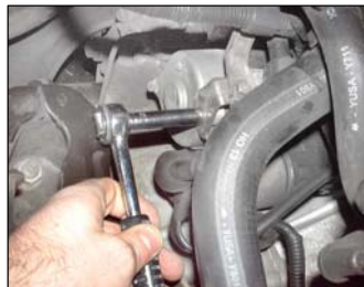
Fig. # 5