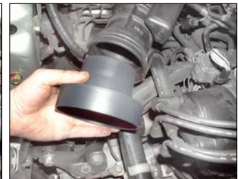
Fig. # 7