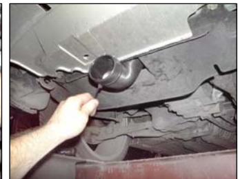
Fig. # 11