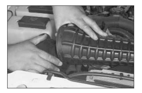
5. Detach the intake tube from the airbox.

4. Disconnect the secondary mass air sensor electrical connection.