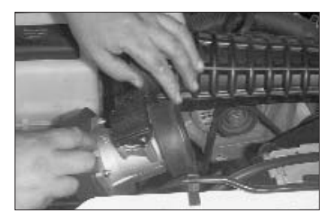
15. Install rubber intake adapter onto mass air sensor.