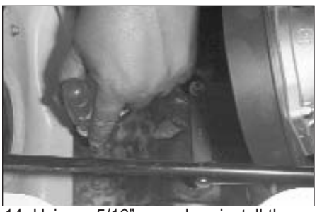
14. Using a 5/16" wrench, reinstall the mass air assembly into the fender using the original hardware.