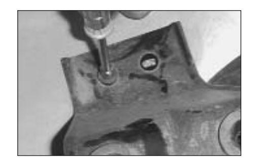
10. Remove the lower airbox support bracket from fender well.