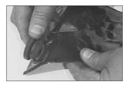
11. Remove the grommets from lower airbox support bracket.