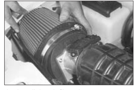
17. Install the air filter element onto mass air adapter and secure with the provided hose clamp.