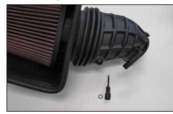
9. Remove the inlet air temperature sensor from the factory intake tube.

NOTE: Use care while handling the inlet air temperature sensor as it is very fragile.