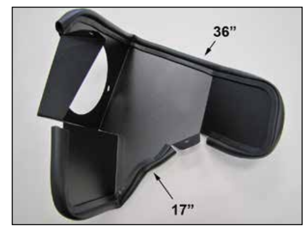
7. Install the edge trim onto the heat shield as shown.