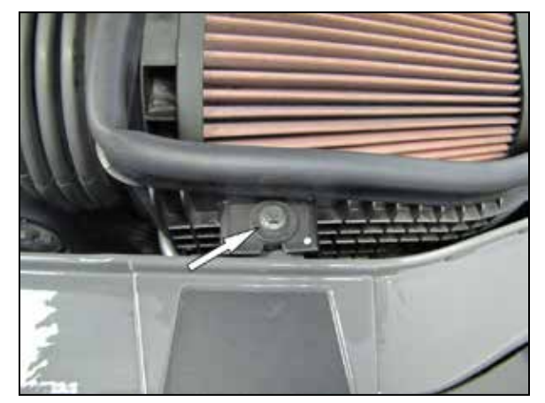
Remove the bolt that secures the air filter housing to the core support.

5. Remove the complete factory intake system from the vehicle.