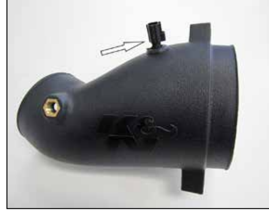
10. Install the provided grommet into the K&N® intake tube, then remove the o-ring from the inlet air temperature sensor and install the sensor into the grommet.

NOTE: Use care while handling the inlet air temperature sensor as it is very fragile.