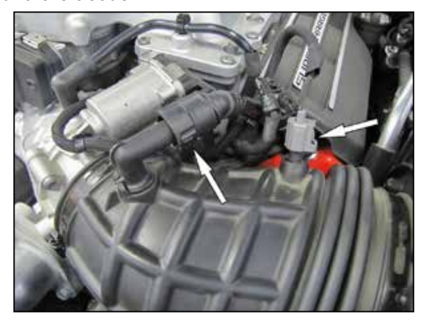
2. Disconnect the inlet air temperature sensor electrical connection and the crank case vent line from the factory intake tube.