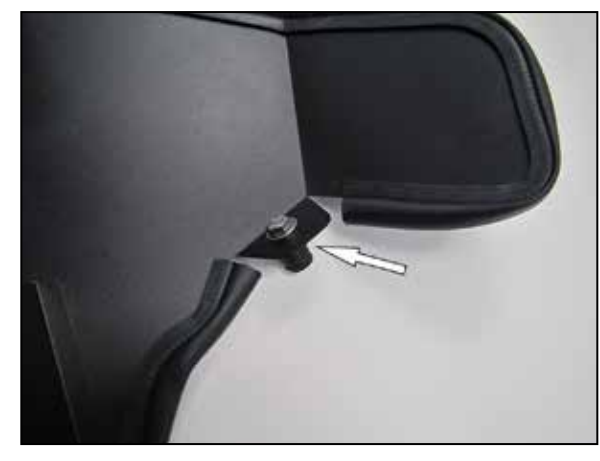
8. Install the nut insert onto the heat shield and secure with the provided hardware.