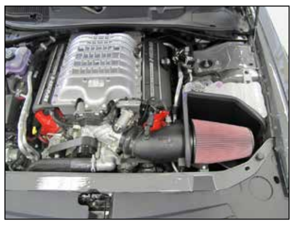
16. Install the K&N® air filter onto the filter adapter and secure with the provided hose clamp.

15. Recommect the iniet all temperature senso electrical connection and crank case vent line.