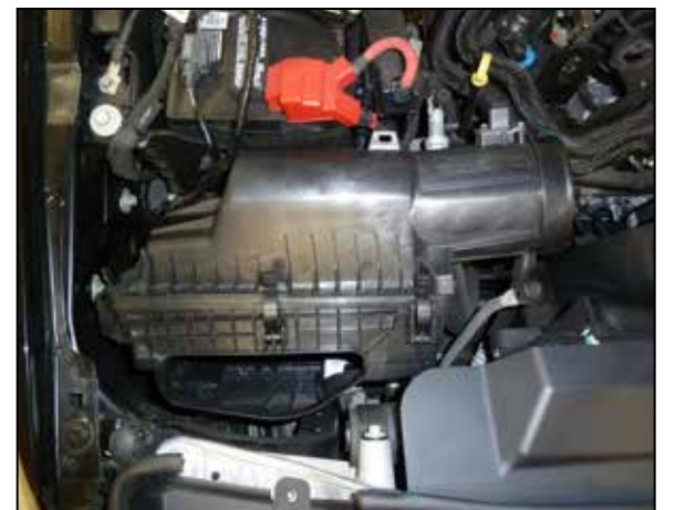
6. Pull up the air filter housing and remove it from the vehicle.