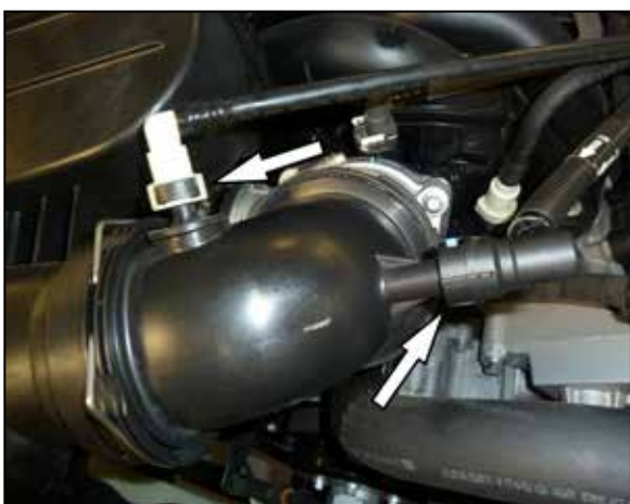
2. Disconnect the two CCV hoses from the factory intake tube.