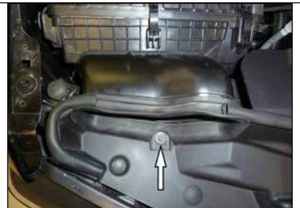
5. Remove the push pin securing the fresh air intake duct and then remove the duct from the vehicle.