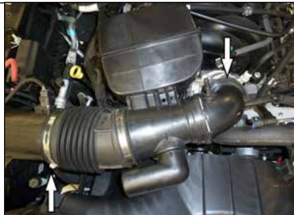
3. Loosen the two hose clamps securing the factory intake tube and then remove the intake tube from the vehicle.