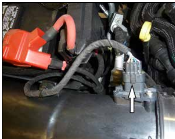
4. Disconnect the MASS air sensor electrical connection.