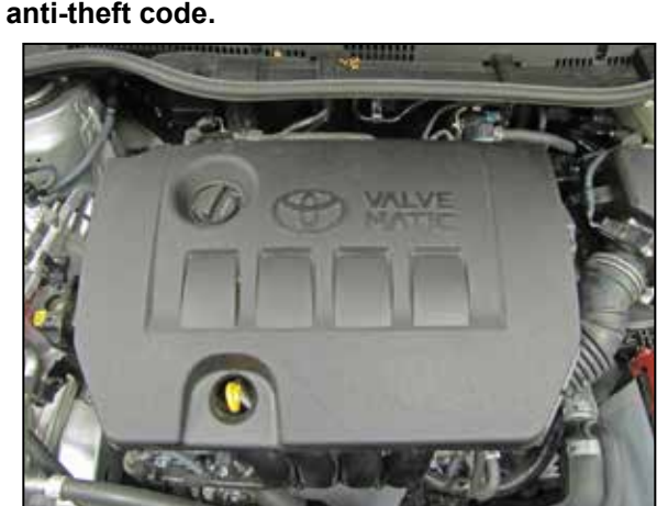
2. Lift up and remove the decorative engine cover.

NOTE: Disconnecting the negative battery cable erases pre-programmed electronic memories. Write down all memory settings before disconnecting the negative battery cable. Some radios will require an anti-theft code to be entered after the battery is reconnected. The anti-theft code is typically supplied with your owner's manual. In the event your vehicles anti-theft code cannot be recovered, contact an authorized dealership to obtain your vehicles