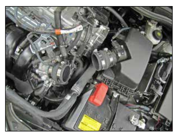
5. Install the provided hump couplers onto the throttle body and air filter housing and secure with the provided hose clamps.