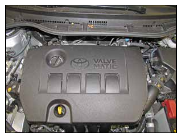
8. Reinstall the decorative engine cover