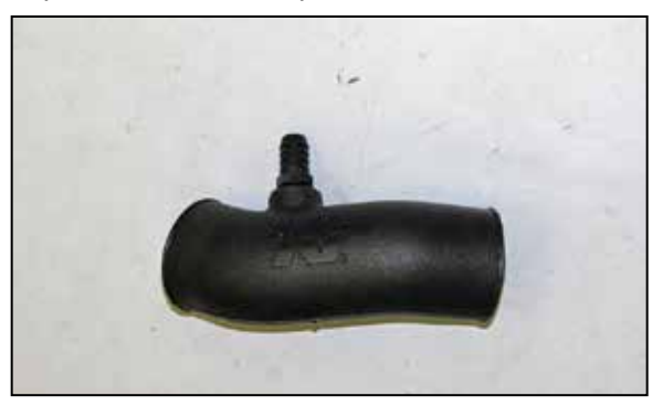
6. Install the provided crank case vent fitting into the K&N® intake tube as shown.

NOTE: NPT fitting has tapered threads and only designed to be installed until hand tight, then tighten one rotation or when the fitting becomes difficult to return.