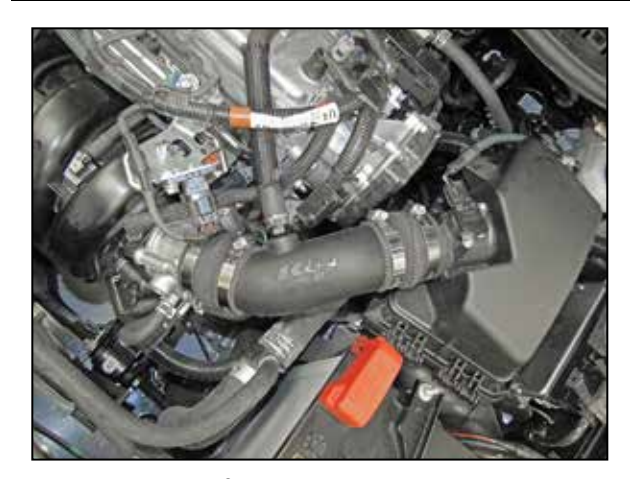
7. Install the K&N® intake tube into the coupler at the throttle body and then into the coupler on the air filter housing, adjust the tube for best fit and then secure with the provided hose clamps. Install the crank case vent hose onto the fitting and secure with the factory spring clamp.