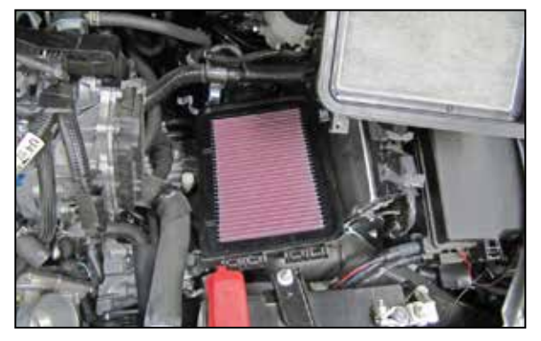
4. Release the clips that secure the upper air filter housing, lift up the housing and remove the factory air filter. Install the provided K&N® air filter and then reinstall the upper housing and secure with the factory retaining clips.

NOTE: K&N Engineering, Inc., recommends that customers do not discard factory air intake.