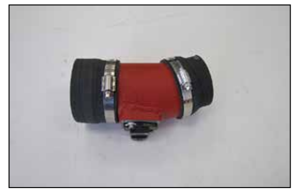
13. Install the provided coupler (084034) onto the outlet side of the K&N<sup>®</sup> intake tube and secure with the provided hose clamp.