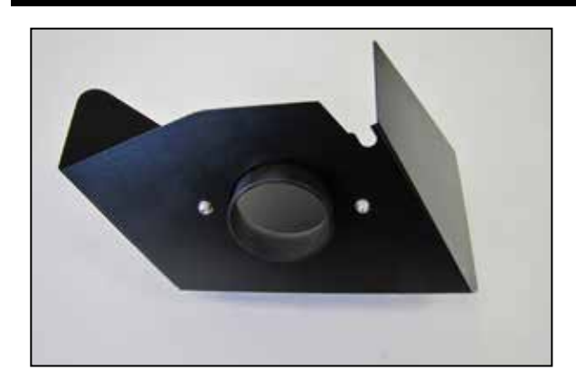
7. Install the filter adapter into the heat shield and secure with the provided hardware.