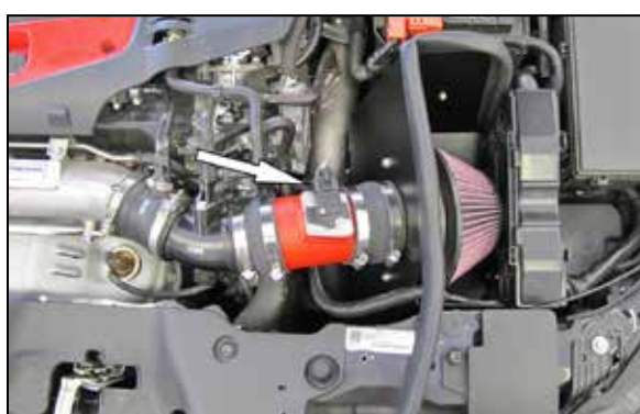
15. Remove the plastic harness holder from the mass air sensor harness. Install the provided split harness cover and secure with electrical tape. Route the harness through the notch in the front of the heat shield and then reconnect the mass air sensor electrical connection.

NOTE: Be sure the tube is in the correct direction, the opening in the mass air sensor should be towards the air filter.