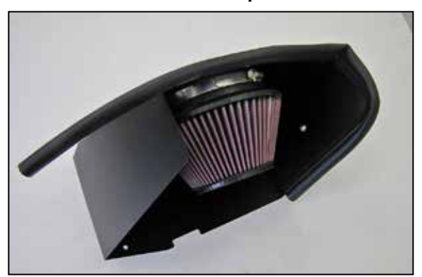
9. Install the K&N® air filter onto the filter adapter and secure with the provided hose clamp.