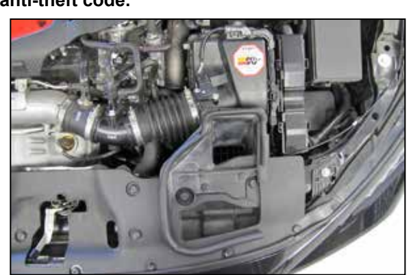
2. Disconnect the mass air sensor electrical connection and unhook the harness from the air filter housing.

NOTE: Disconnecting the negative battery cable erases pre-programmed electronic memories. Write down all memory settings before disconnecting the negative battery cable. Some radios will require an anti-theft code to be entered after the battery is reconnected. The anti-theft code is typically supplied with your owner's manual. In the event your vehicles anti-theft code cannot be recovered, contact an authorized dealership to obtain your vehicles anti-theft code.