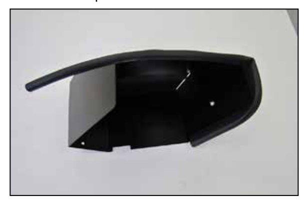
8. Install the provided edge trim onto the heat shield as shown.