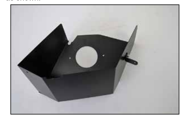
6. Install the provided mounting bracket onto the heat shield and secure with the provided hardware.