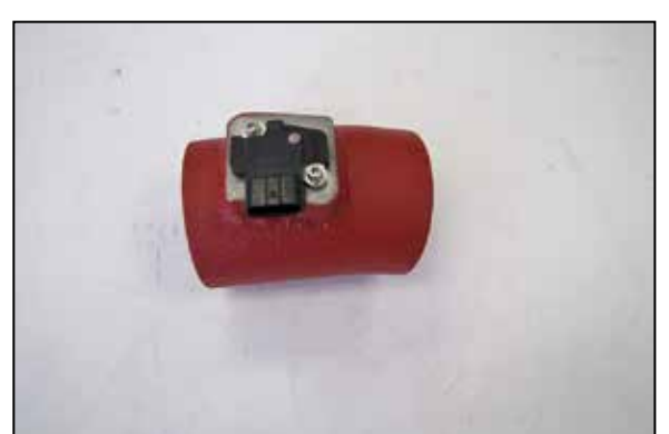
11. Remove the mass air sensor from the factory housing and install it into the K&N® intake tube as shown.