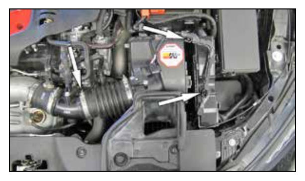
3. Release the upper air filter housing clips and loosen the hose clamp that secures the intake hose to the turbo inlet pipe. Remove the upper air filter housing and intake tube from the vehicle.