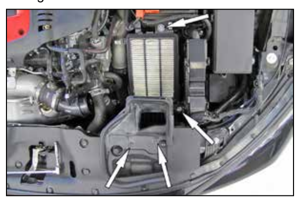
4. Remove the four bolts that secure the lower air filter housing and fresh air scoop and then remove the complete assembly from the vehicle.

NOTE: K&N Engineering, Inc., recommends that customers do not discard factory air intake.