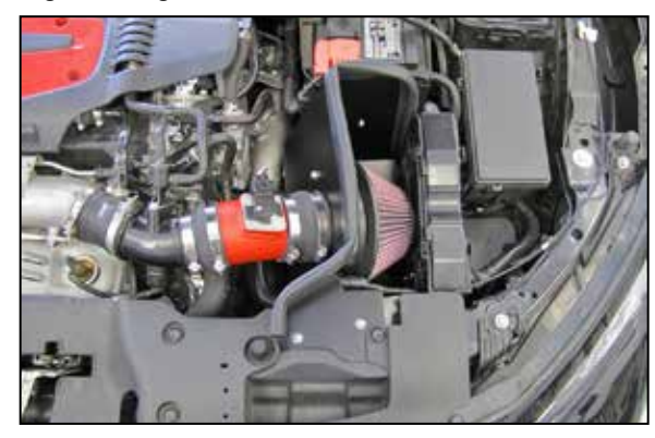
17. Reconnect the vehicle's negative battery cable. Double check to make sure everything is tight and properly positioned before starting the vehicle.

18. It will be necessary for all K&N® high flow intake systems to be checked periodically for realignment, clearance and tightening of all connections. Failure to follow the above instructions or proper maintenance may void warranty.