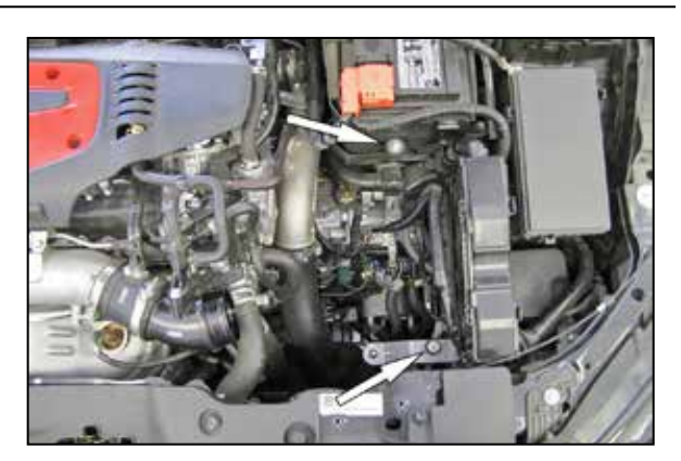
5. Install the two provided rubber mounted studs into the factory air filter housing mounting locations as shown.

NOTE: K&N Engineering, Inc., recommends that customers do not discard factory air intake.