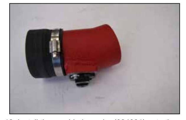
12. Install the provided coupler (084091) onto the inlet side of the K\&N^{@} intake tube and secure with the provided hose clamp.