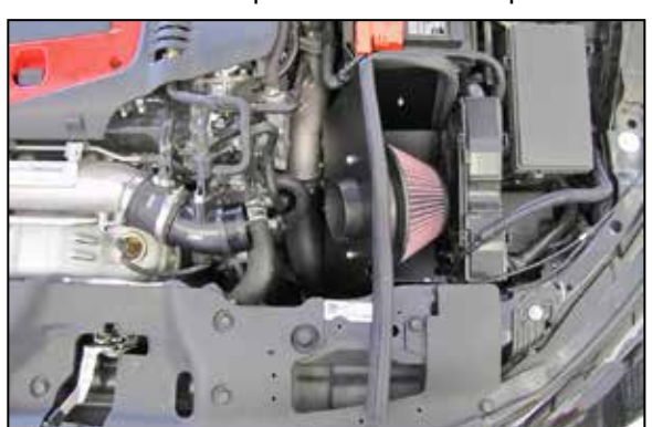
10. Set the heat shield assembly into position on the rubber mounted studs and then secure with the provided hardware.