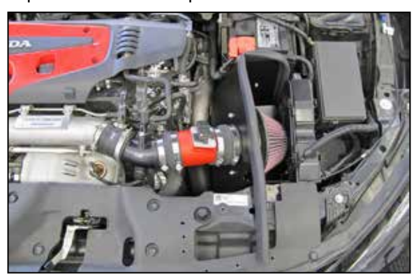
14. Install the intake tube assembly onto the turbo inlet and filter adapter, adjust the tube for best fit and secure with the provided hose clamp. NOTE: Be sure the tube is in the correct direction, the appring in the mass air sensor.

NOTE: Be sure the tube is in the correct direction, the opening in the mass air sensor should be towards the air filter.