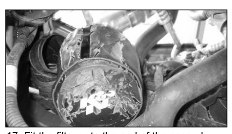
17. Fit the filter onto the end of the second intake tube using the hose clip supplied.