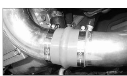
13. Install the second intake tube approximately 2.5cm / 1" into the hump hose.