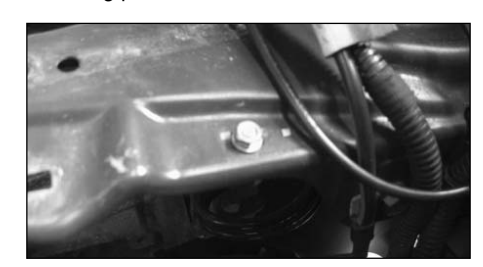
8. Fit the nut and washer to the top of the vibration mount.