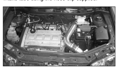
18. Place back the under tray, battery tray and battery. Reconnect the vehicle's negative battery cable. Double check to make sure everything is tight and properly positioned before starting the vehicle.

19. It will be necessary for all Typhoons to be checked periodically for realignment, clearance and tightening of all connections. Failure to follow the above instructions or proper maintenance may void warranty.