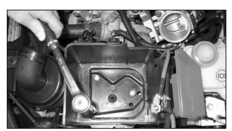
4. Remove the three bolts securing the battery tray to the vehicle.

3. Following manufacturer's instructions, carefully remove the battery from the vehicle.