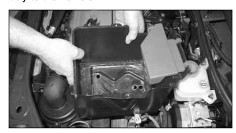
5. Carefully remove the battery tray from the