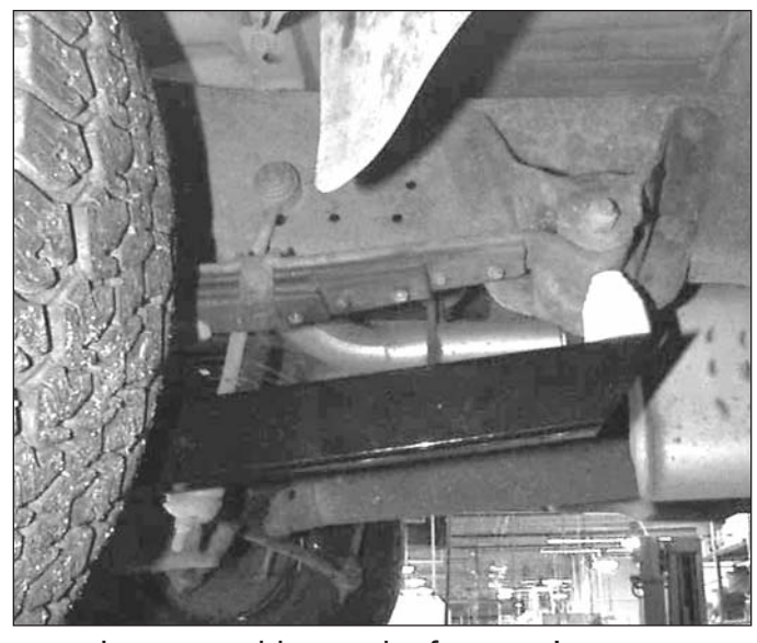
Locate snubber under front spring eye.