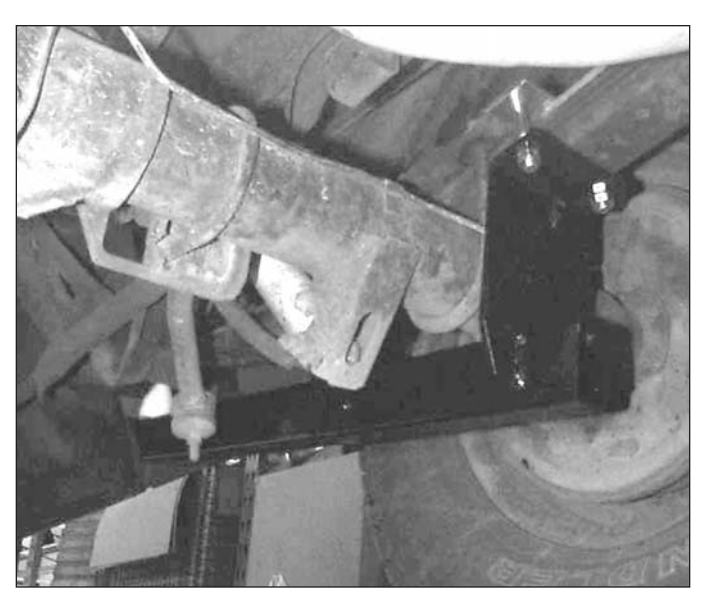
Rear bracket with mounting clamp on top of spring.

Urethane Snubbers (2/set) ......#20700 Rubber Snubbers (2/set) ......#20530