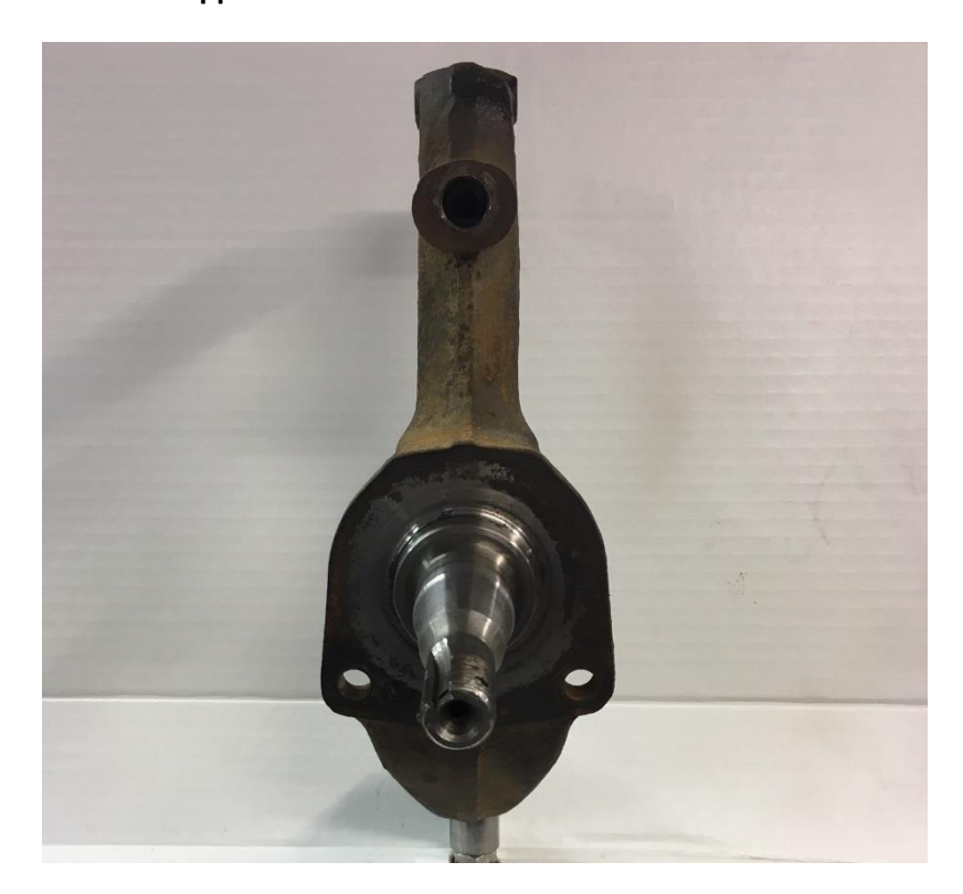
← Front of Car

Applications : 1959-64 Chevrolet Full Size Cars