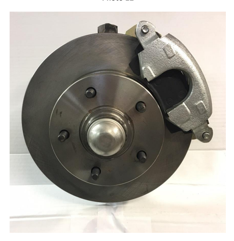
← Front of Car