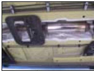
TUNNEL BRACE (TO BE RE-USED)