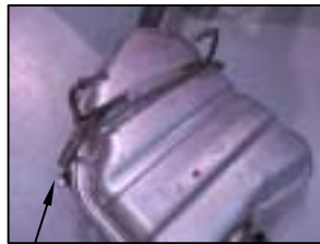
HANGER STRAP (TO BE REMOVED)