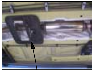
TUNNEL BRACE (TO BE RE-USED)