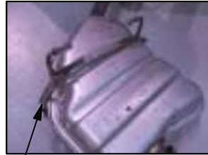
HANGER STRAP (TO BE REMOVED)