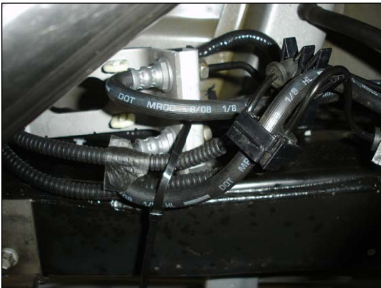
Fig # 2

Step 4: Once a final position has been chosen for the new system, evenly tighten all fasteners from front to rear. The supplied band clamps must be VERY tight to properly align the pipes and prevent leaks (Approximately 65ft-lbs). Inspect all fasteners after 25-50 miles of operation and retighten if necessary.