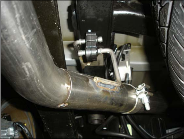
Fig # 1

Step 3: With all components mounted loosely, adjust the system for overall aesthetics and clearance of frame & bodywork. (MAGNAFLOW recommends at least 1/2" of clearance between the exhaust system and any body panels to prevent heat-related body damage or fire.)