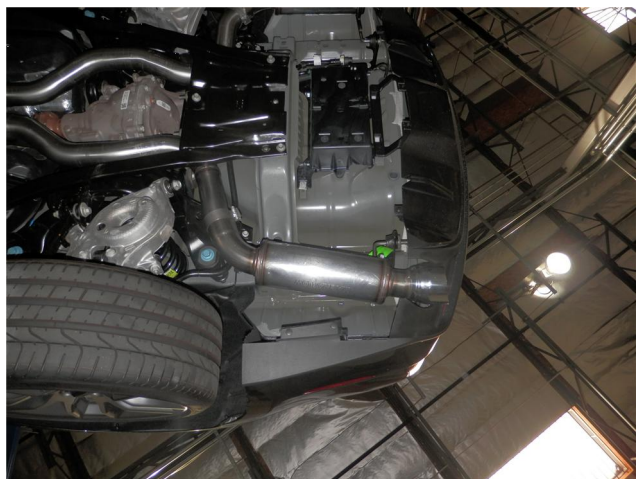
Step 4. Finish the initial installation by fitting the Muffler Assemblies onto the Mid pipe Assemblies using the supplied 3.00" clamps and inserting the hangers into the rubber insulators.

MAGNAFLOW: 22961 Arroyo Vista - Rancho Santa Margarita, CA 92688 | 1(800) 990-0905 Technical Support: 1(800) 959-9226 | Email: moreinfo@magnaflow.com