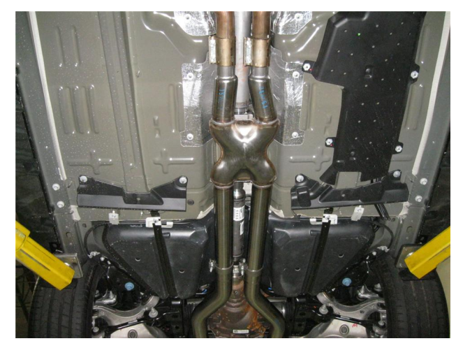
Step 2. Begin installation of the new system by loosely attaching the X-Pipe Assembly to the outlets using the OEM clamps. Leave all clamps loose until final adjustment.

Step 1. Begin removing the OEM exhaust system by loosening the clamps located in front of the resonator. Next working front to rear extract the hangers from the rubber insulators and remove the OEM system. Retain insulators and clamps as they will be used to install the new system.