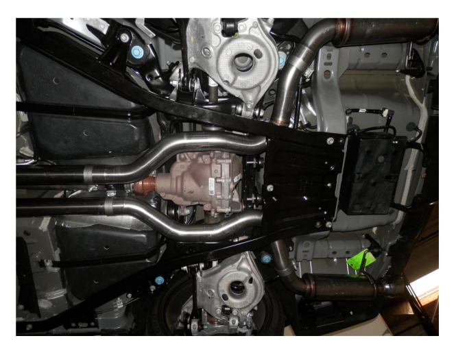
Step 3. Next attach the Mid Pipe Assemblies to the X-Pipe using the supplied 3.00" clamps and fitting the hangers into the rubber insulators.